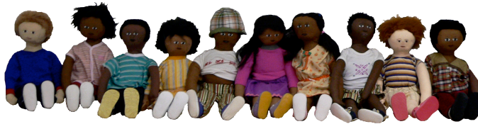
Department of Social Development Ububele Persona Dolls (2010)