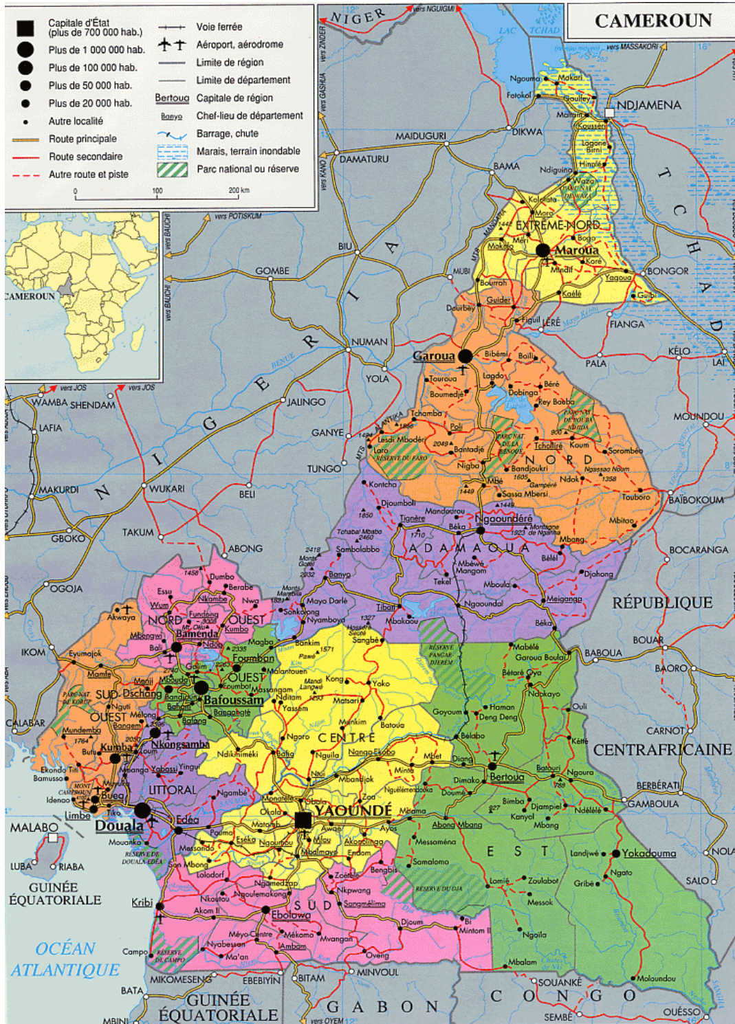
Figure 2.1: A Detailed Map of Cameroon

the Africa) and its largest cities include: Douala, Yaoundé, and Garoua (see Figure 2.1). This country is also renowned for its native genre of music, its national team, and ranks 150 on the UNDP Human Development Index.