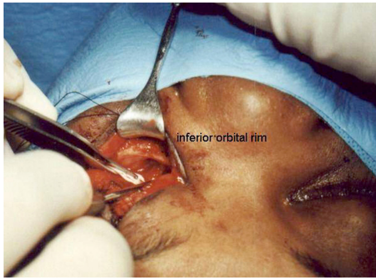
Figure. 3.1 Transconjunctival surgical approach used to expose orbital fracture.

After the surgical incision was made, the surgeon then exposed and explored the orbital floor and walls. The fracture was identified, the entrapped tissue was released and the bony fragments were elevated into position or removed to allow repositioning of the orbital contents. 3-5