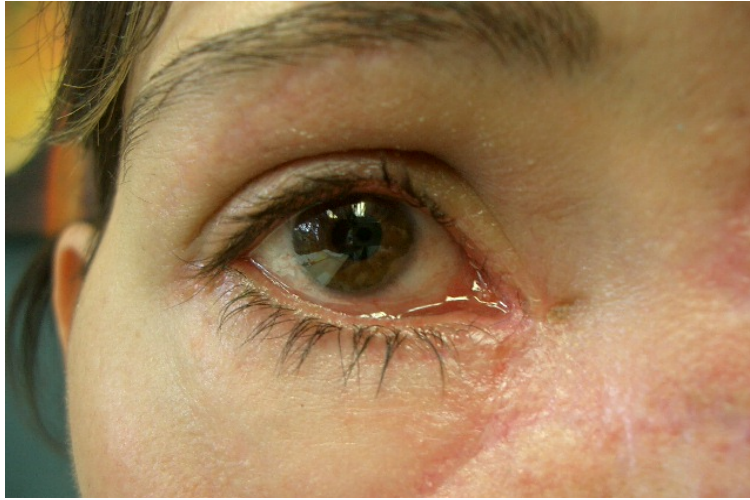
Figure 4.1 Surgical complication: Lower lid retraction. Case 3 showing lower lid complication following previous repair via transcutaneous surgical approach using bone graft. This patient also presented with persistent postoperative diplopia symptoms which resolved following revision surgery. In addition, a skin graft was required to correct the lower lid retraction.