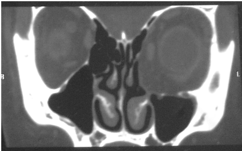
Figure 1.1 Computerized tomography scan showing left orbital blowout fracture involving the floor and medial wall.

Blowout fractures involving the orbital floor and or medial wall (Figure 1.1), orbitozygomatic fractures resulting from midfacial trauma and naso-orbito-ethmoid fractures are some commonly identified fracture patterns. 1