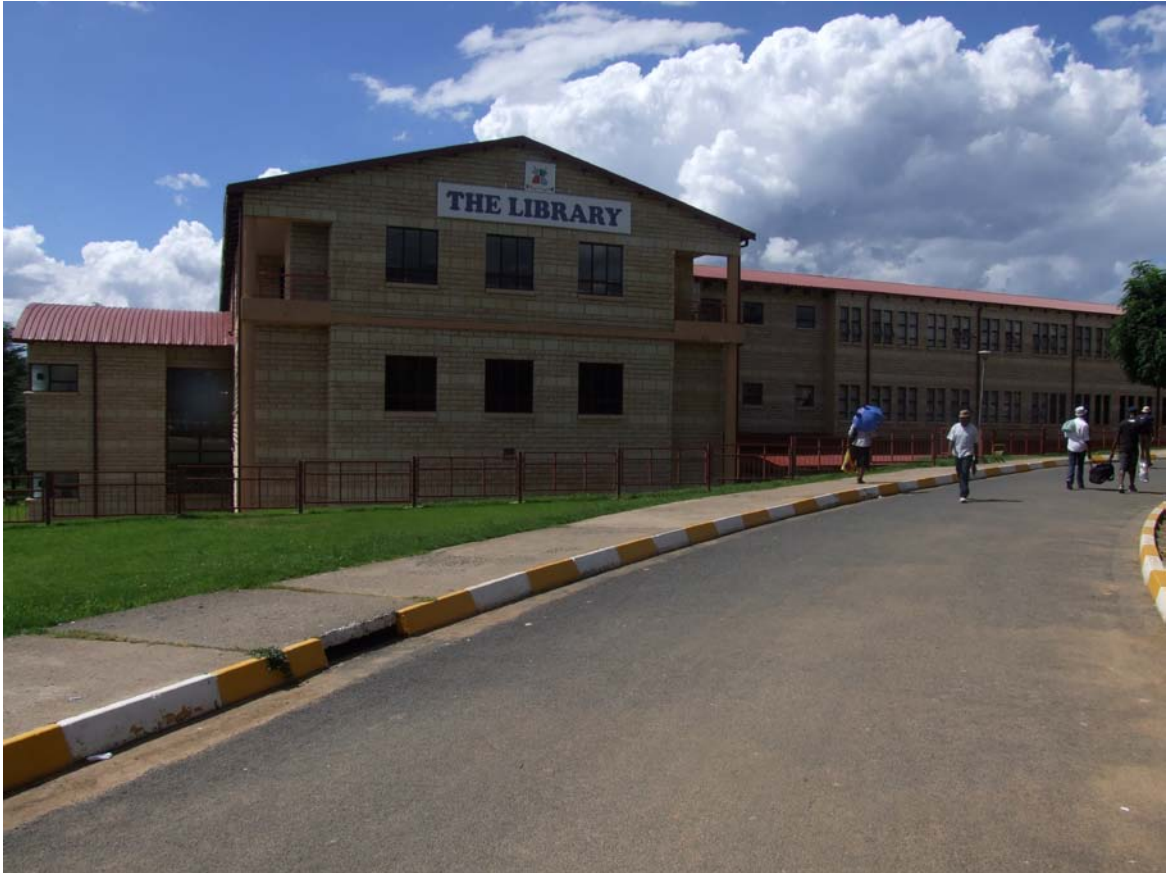
SIDE VIEW OF PHASE 3 OF THE NUL LIBRARY