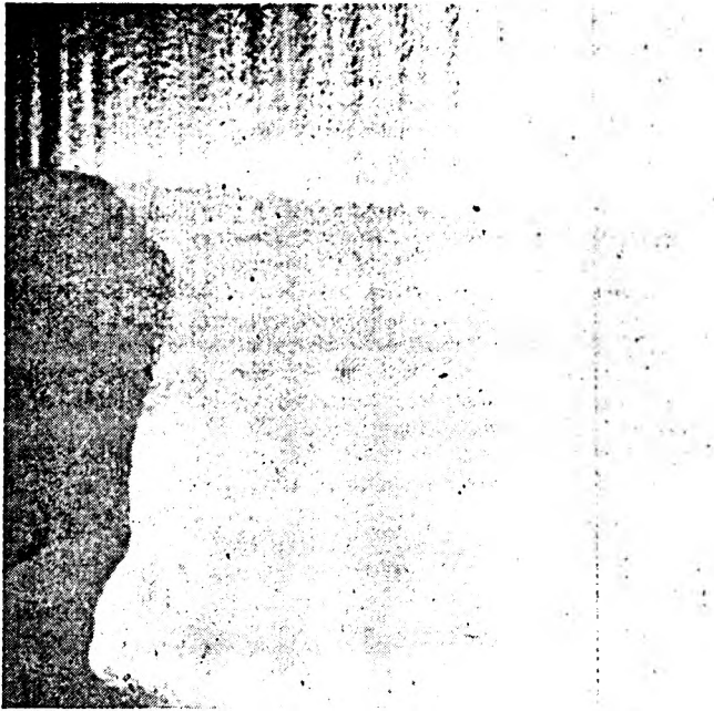
Fig. 1 ISOPAST with CONTACT RESIN. No leakage (Class 0). Top - embedding resin. Left middle - enamel. Left bottom - dentine. Right - filling resin.