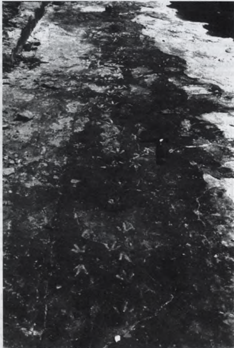
Figure 3. Close up view of the palaeosurface seen in Figure 1. The tracks with a geological hammer for scale.