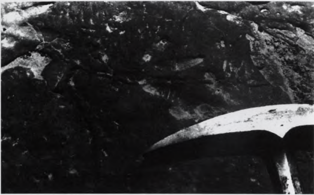
Figure 4. The tridactyl print above the sharp end of the hammer has a worm trail ( Planolites ) superimposed on it.

impressed in soft, saturated mud, such that some of the disturbed sediment fell back into the prints, diffusing the outlines of the toe prints and causing the toes to appear a little wider than they should be. We could find only one short drag mark, and this was more likely made by the middle toe of a partially raised foot, than by a tail.