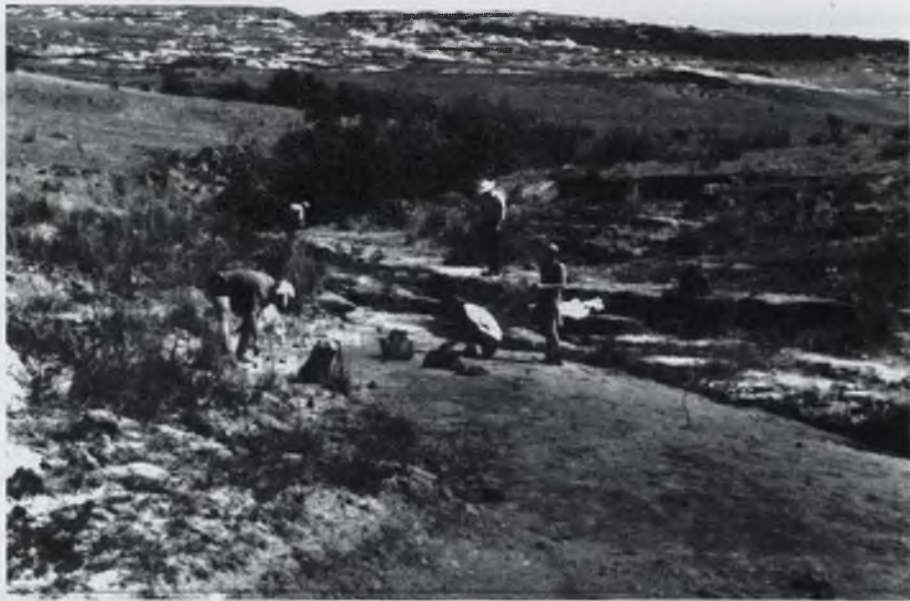
Figure 2. Students examining the track bearing pavement. Clarens Formation sandstone in the distance. Invasive exotic plants choke the gullies.