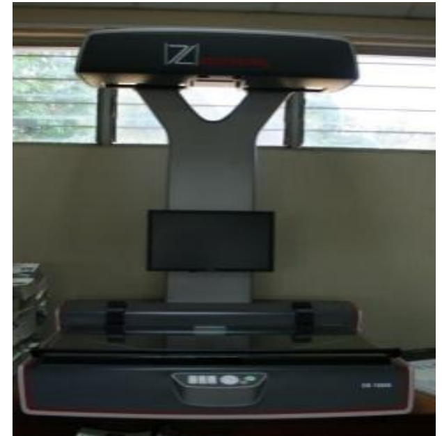
A heavy duty scanner at COM