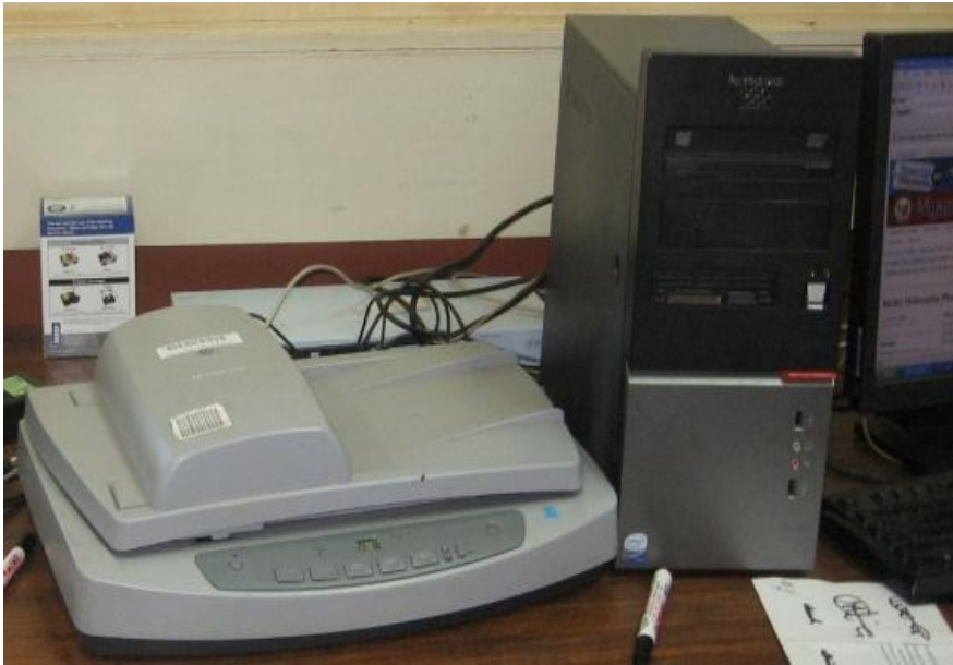
An office scanner based at Bunda College