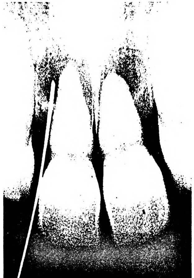
Fig. 1 b: Radiograph of upper central incisors, with a silver point inserted into the periodontal pocket.