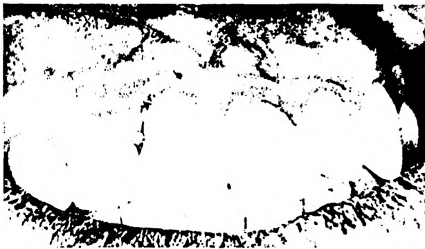
Fig. 3: Clinical photograph taken 2 years post-operatively, showing inflammation and recession of the labial gingiva of the upper right central incisor.