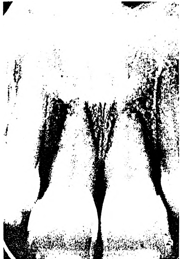
Fig. 5: Radiograph 4 1/2 years post-operatively with evidence of alveolar regeneration distal to the upper central incisors.

The accidental production of periodontal lesions by elastic bands appears to be uncommon. Kwapis and Knox (1972) and Cooper et al (1970) report cases of accidental extrusion of teeth by elastics. In these cases the patients were also unaware of the continued pressure of the elastic bands. This report is presented not only because it draws attention to the danger of prescribing elastic bands without an orthodontic aid for retaining it, but also because of the noteworthy re-attachment that was achieved. Ramfjord (1951) defined the term re-attachment as a unification or attachment between tooth and the adjacent soft tissue wall of the periodontal pocket. Despite Ramfjord's definition and the correlation he