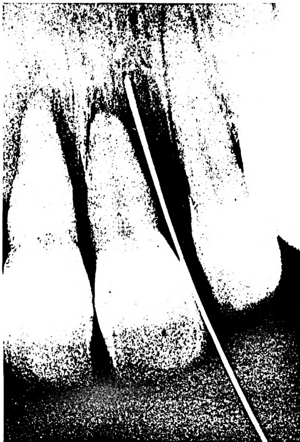
Fig. 1 a: Radiograph of upper central incisors, with a silver point inserted into the periodontal pocket.

An inverse - bevel incision was made on the labial aspect of the gingiva from lateral to lateral incisor with two releasing incisions and the tissue was reflected. This revealed denudation of the labial and distal surfaces of the roots of the central incisors and of the mesial surface of the right lateral incisor; and the presence of an elastic band around the apices of the two central incisors. The extent of the loss of bone and the position of the elastic band (Fig. 2) could be assessed only after the granulation tissue had been removed. The elastic band was removed, the affected areas were curetted thoroughly and the root surfaces planed. The flap was replaced and sutured into position and a periodontal dressing was placed over the wound. The post-operative period was uneventful. The splint was left in place for 3 months, during which time occlusal adjustment was carried out and repeated scalings were done.