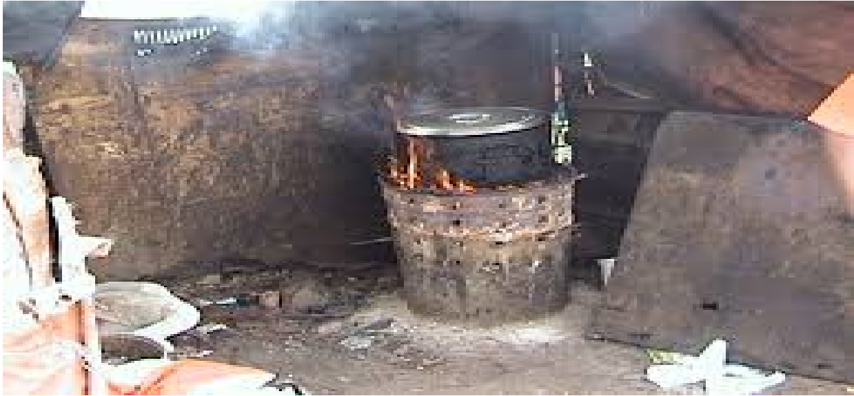
Figure 8: Imbawula (brazier) in a separate room for cooking in one respondent's household in Ramaphosa. Picture taken by author, 10/ 10/ 2015