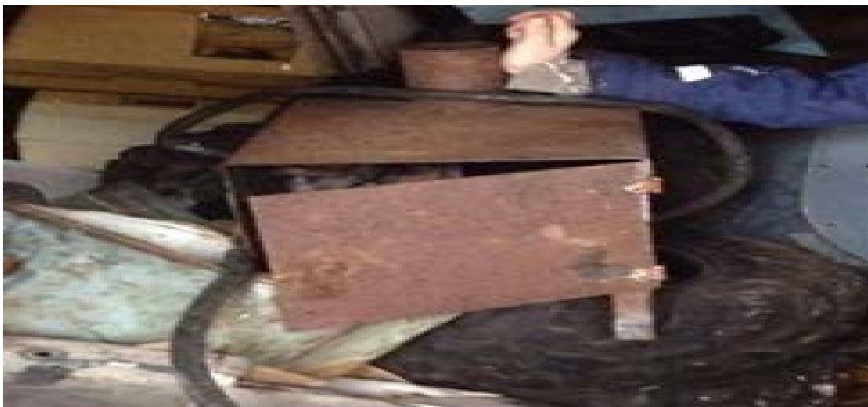
Figure 7: Shangaan stove inside a respondent's household in Ramaphosa. Picture taken by author, 10/11/2015

Respondents who stay in one room shacks store their coal just behind the entry door whilst the established families store their coal in a separate room. Coal fire is prepared twice a day, i.e., in the mornings and evenings. Five of the eleven interviewed respondents were observed using their stoves. All five stoves were not efficiently channeling the smoke through the chimney. Evidence of this was a smoky room and soot on the surfaces of these homes. The other three homes belong to established families who avoid this situation by having big windows that create sufficient ventilation inside.