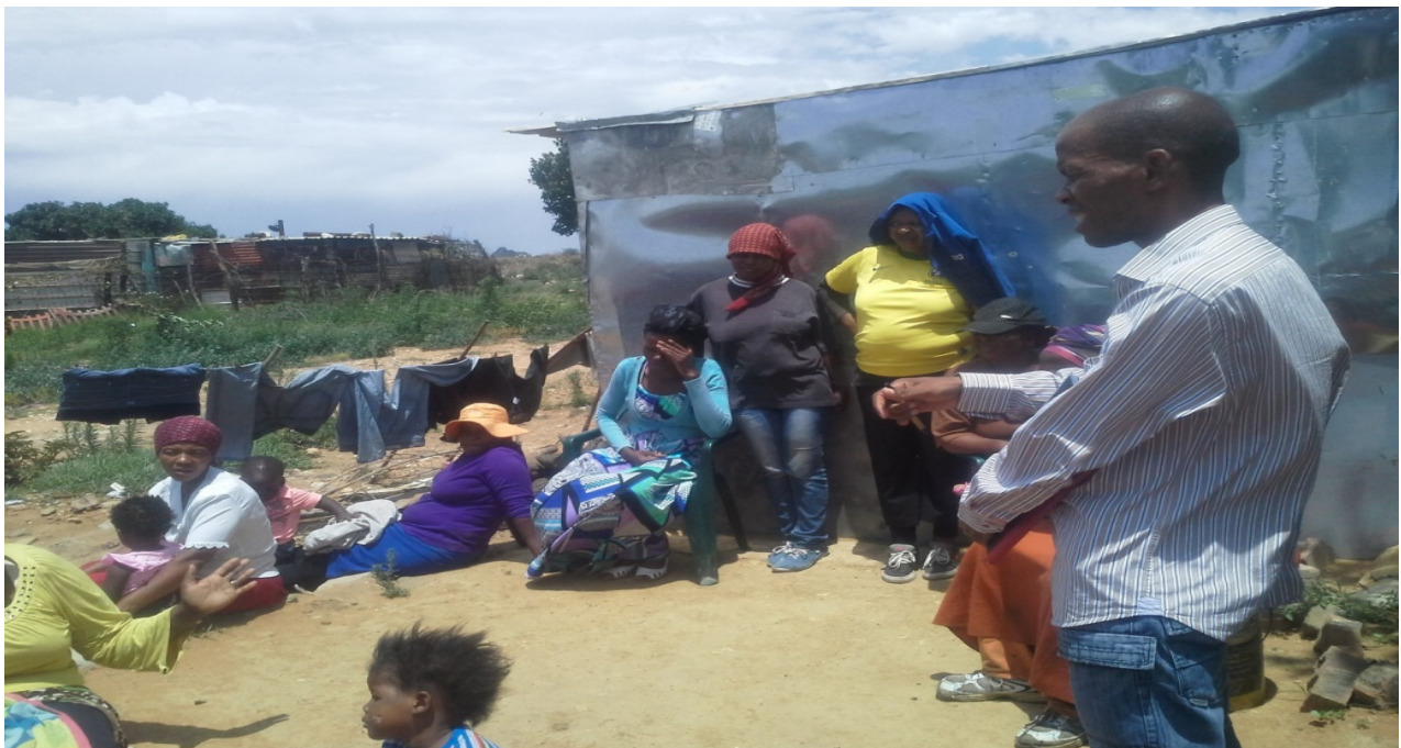
Figure 5: Focus Group Discussion in Ramaphosa Informal Settlement (Picture taken by author: 08/11/ 2015)

The limitation of these expert interviews is in my failed attempts to interview the ward councilor. This could not take place as he kept on requesting a postponement of our meeting up until writing of this report.