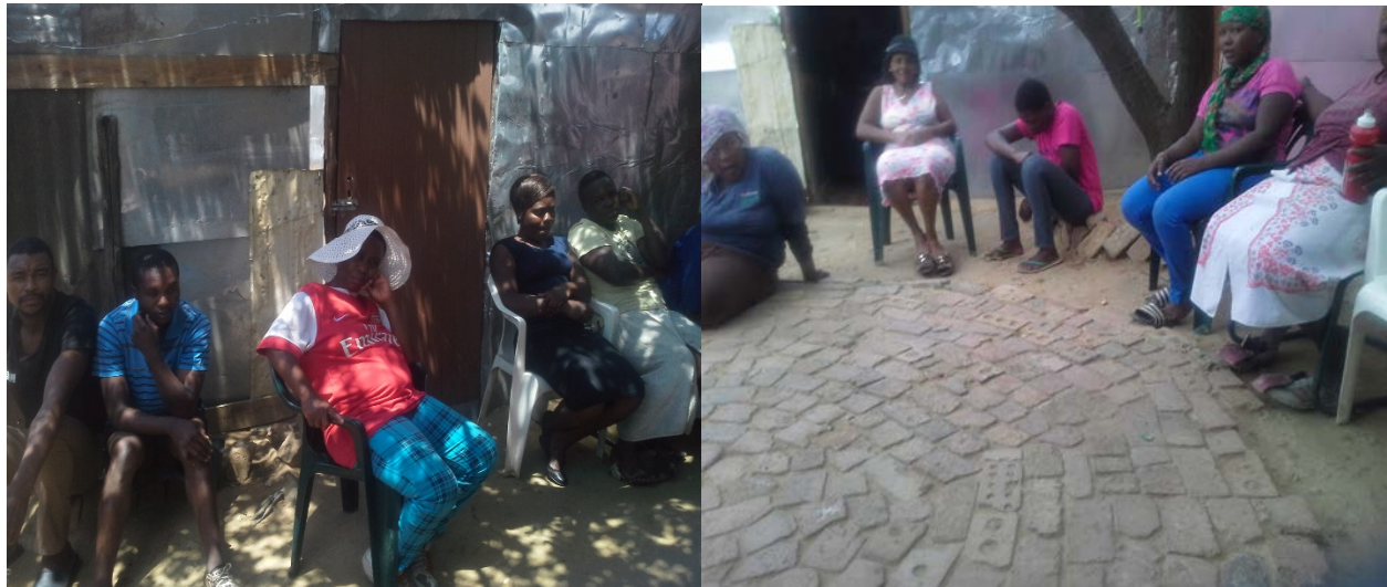
Figure 4: Focus Group Discussions in Ramaphosa Informal Settlement

Having secured access from the community leaders to conduct my research, data was then collected through a combination of techniques that included semi-structured interviews, focus group discussions that were guided by an interview schedule, observations and expert interviews. The sample characteristics included men and women who have their own household, have need for and use fuel, and were willing to participate.