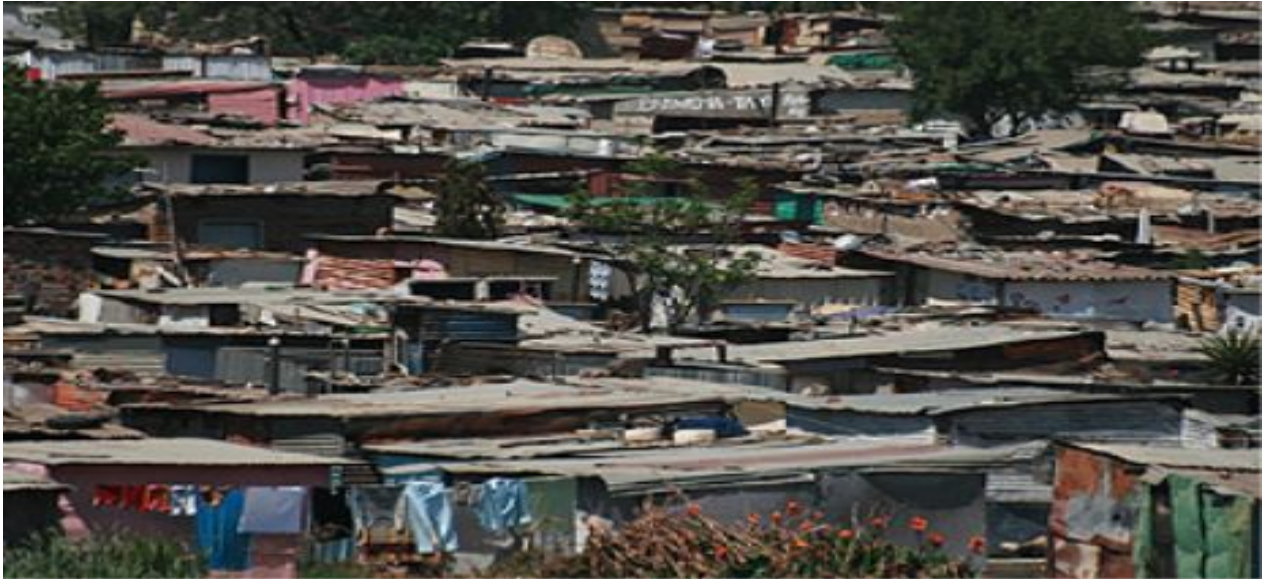
Image taken from the Internet. The link is provided in Page 45 of the Reference list.

Ramaphosa is a very densely populated area containing various ethnic groups and Nationalities. Its residents came from long established neighbouring communities like Reiger Park, Vosloorus, Daveyton and others. Other residents come from the Limpopo, Eastern Cape and Kwa-Zulu Natal Provinces. Residents have chosen this area because it is closer to both Germiston and Boksburg industrial towns which they can access in search of job opportunities. There is also a prominent presence of foreign nationals from countries like Malawi, Mozambique and Zimbabwe.