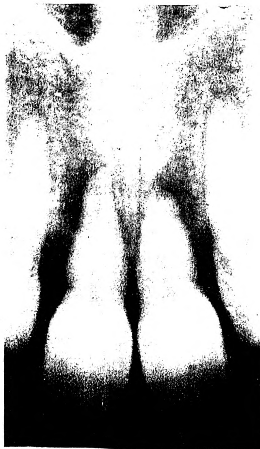
Fig. 5 Original intra-oral radiograph taken at the time of surgical intervention.