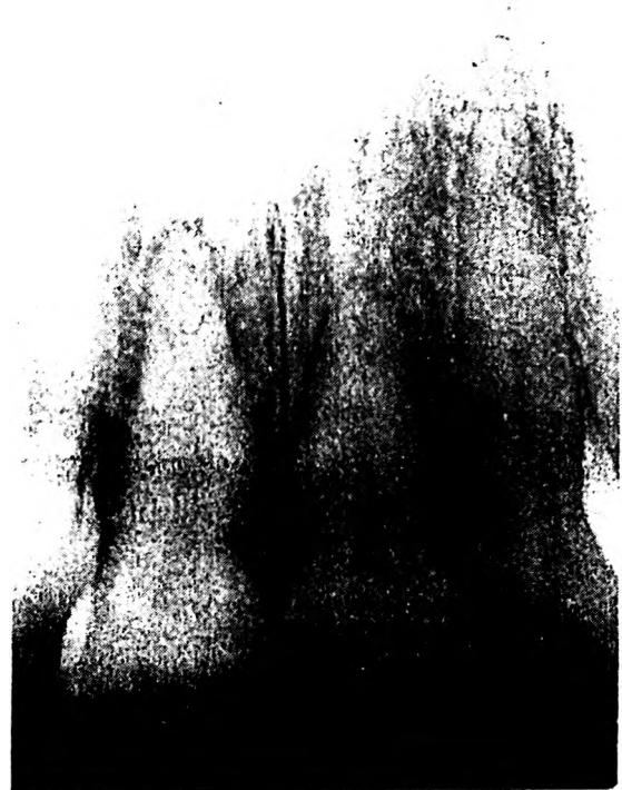
Fig. 6 Present intra-oral radiograph, showing alveolar regeneration around the upper central incisors.