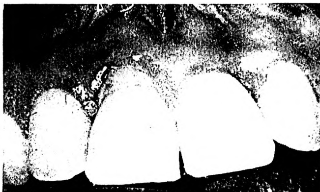
Fig. 3 Clinical photograph 4½ years postoperatively. Recession labial to the upper right central incisor persists, but gingival inflammation is minimal.