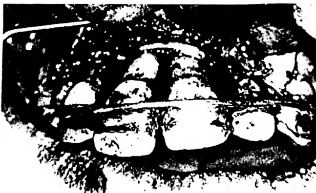
Fig. 1 Photograph of the lesion after reflection of the soft tissue. The elastic band around the apices of the central incisors and the loss of bone on the distal and labial aspect of the incisors is seen.