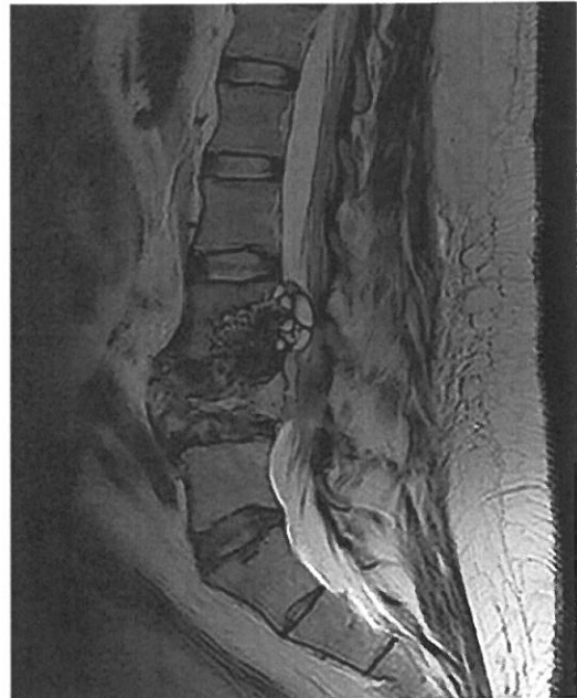
FIGURE 1. Sagittal magnetic resonance imaging (T2-weighted) of the lumbosacral spine showing an expansile multicystic lesion causing destruction of the fourth lumbar vertebra.