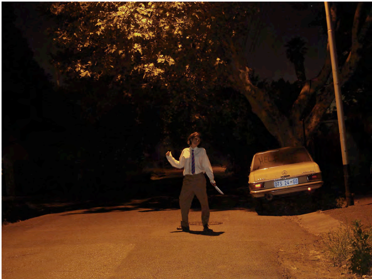
Plate 20: Sober&Lonely, Calla-Nightwatch , 2007

accomplishment,” but rather as a concise narrative statement of our concept (Bauman in Auslander, 2005: 27). With knife in hand, and self-consciously bad drag, the resulting aesthetic is reminiscent of Alfred Hitchcock’s Psycho , and although not our initial intention, the photograph bears a strong ‘Sherman-esque’ feel to it 44 (see plate 20).