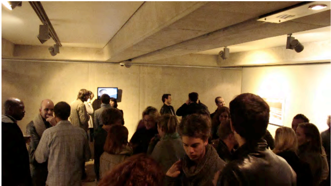
Plate 29: Girl, you know it's true , Circa Gallery, July 2010