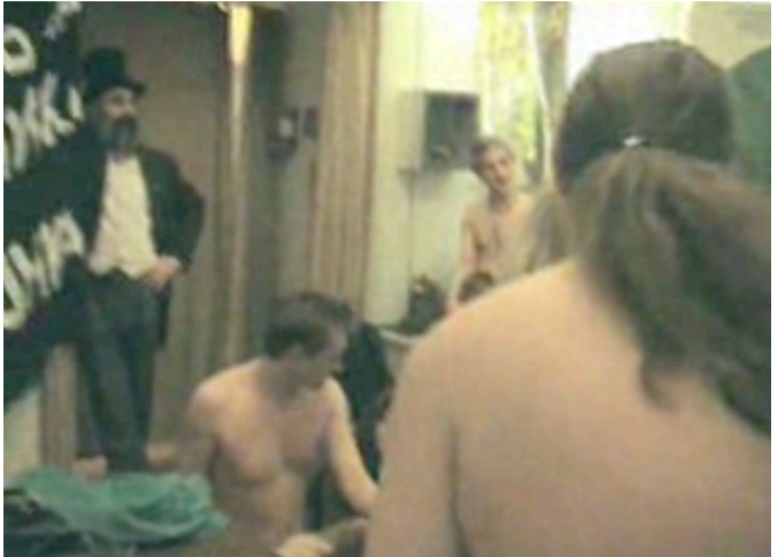
Plate 4: Voina, Fuck for the heir Puppy Bear! , 2008 (screen shot)