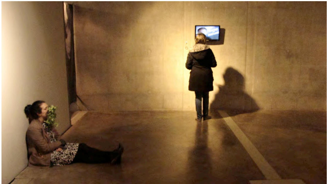
Plate 35: Installation – Seed and Magic , 2010