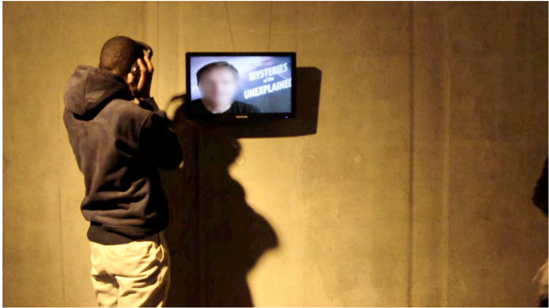
Plate 30: Installation – Magic , 2010