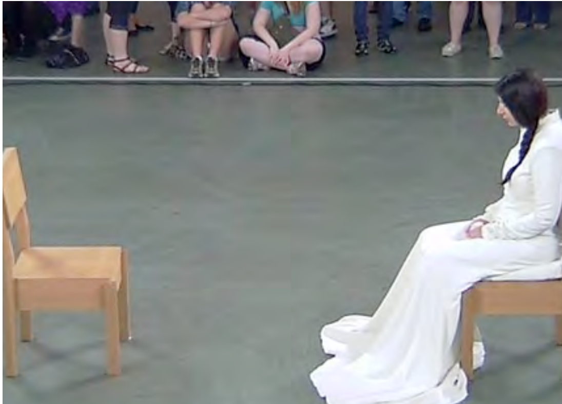
Plate 8: Marina Abramovic, The Artist is Present , 2010

It is important to note that 'Relational Aesthetics' still bears a strong resemblance to 'traditional' performance art. Bourriaud's theory encourages the idea that the "artistic proposition" can affect an audience and produce "sociability" (Bourriaud, 2002: 16). Further, Bourriaud states that it is absurd to assume that "contemporary art does not involve any political project" (Bourriaud, 2002: 13). Thus, performance art is still focused on an 'engagement' with an audience, as well as a political proposition.