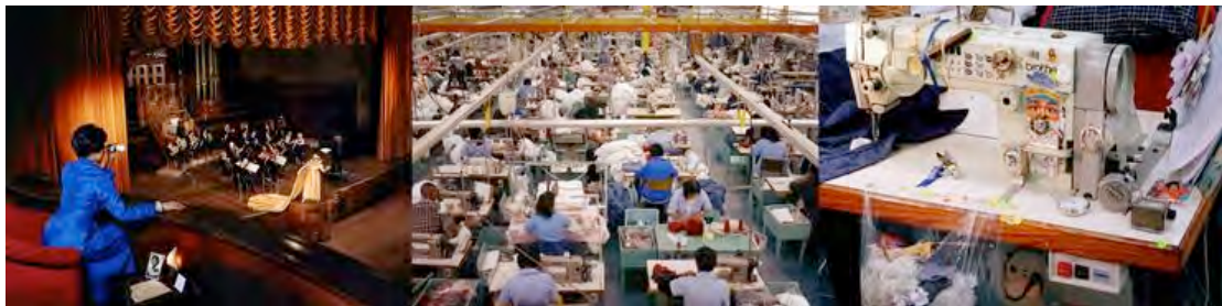
Plate 14: Bridget Baker, The Blue Collar Girl (Durban) , 2005

of The Blue Collar Girl (Delhi) shows a Sherman-esque 34 figure being measured by a tailor in her iconic cobalt coat, as if readying herself for some unspecified act. On the wall above her, an autographed shot of an archetypal film star states “break a leg.” The second frame shows the ‘Blue Collar Girl’ as a “Where’s Waldo” figure in a maze of people in New Delhi’s crowded streets – the protagonist is barely visible, pedalling an impossibly laden cart up the road (Dalton, 2000:47) (see plate 15, 16 and 17). The final image shows a close up of the cart’s contents – a package silk-screened with Baker’s leitmotif: “Only you can ©” 35 . According to Smith, the images speak of the ‘worker’ “liberating [her]self from the complex terrain of social, economic, class and gender politics” (Smith, 2006: 15). Baker’s social commentary becomes more observation than criticism, an optimistic “unmasking [of] the alpha-female” by a ‘super-heroine’ character (Smith, 2006: 3).