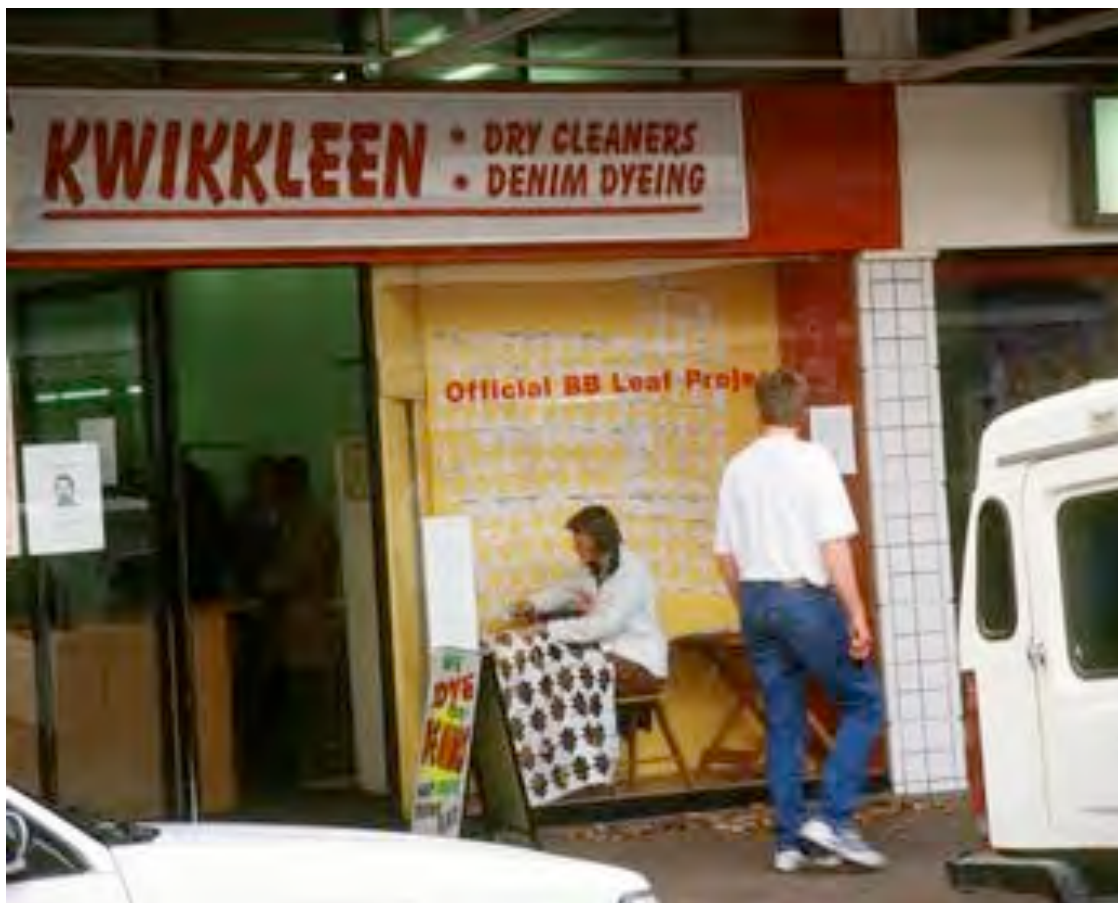
Plate 13: Bridget Baker, Official BB Leaf Project , 2001

pedestrian street in the Stellenbosch city centre. Over a three-month period, working between standard 09h00 to 17h00 business hours, Baker spent the days punching out leaf shapes from ATM 31 receipts. According to Baker, the project sought to explore the exhausting bureaucratic activities involved in being “considered a good citizen” (Baker, 2010). The public was then invited to interact with the project by signing the punched ‘leaves’ of paper. Baker states, “I wanted to explore the artmaking process as a communal act.... How does a community of passers-by and not the art elite respond to the diverse ways of making art by making it in a public space” (Baker, 2007).