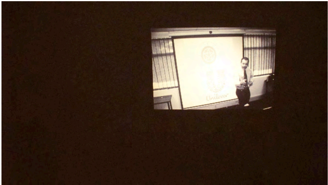
Plate 33: Installation – Trademark , 2010