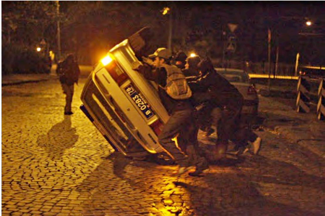
Plate 1: Voina, Palace Revolution , 2010

institutions of cultural and political power in present-day Russia (Tikhonova, 2011 and Voina, 2010). And judging by the heavy-handedness with which they have been dealt, they have clearly been successful.