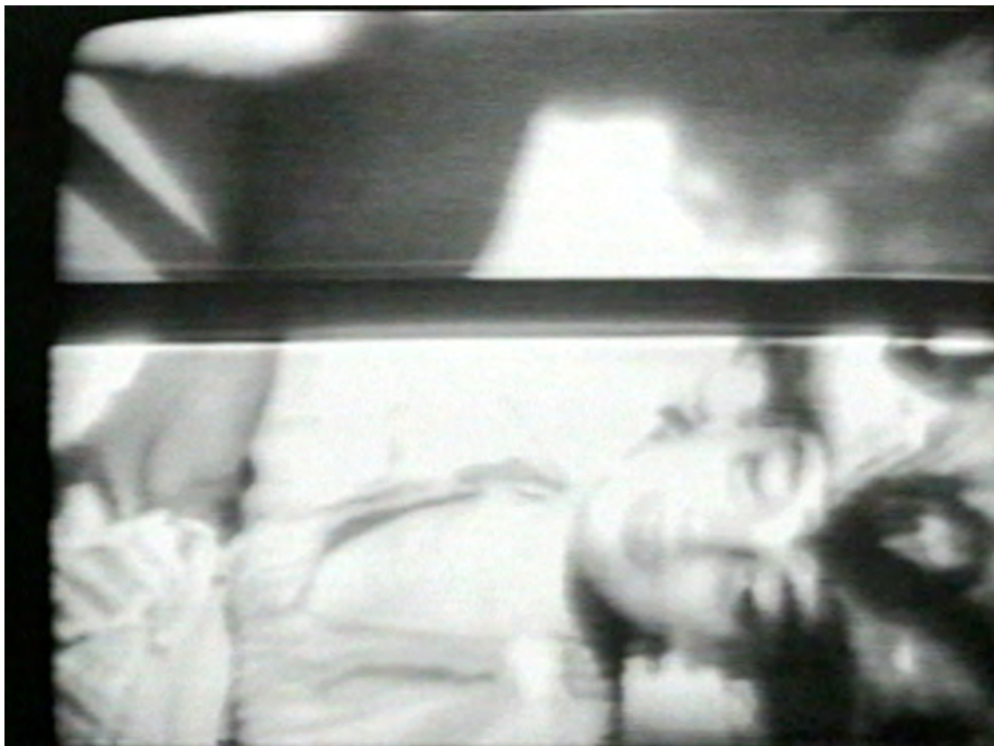
Plate 10: Joan Jonas, Vertical Roll , 1972

movements invisible” (Krauss, 1976: 60). The final seconds of the tape reveal Jonas facing the camera – the only direct reference to a coherent spatial relationship within the otherwise eroded and dissolved imagery (Krauss, 1976: 61). Rather than seeking to create ‘authenticity’ or ‘objectivity’ within the framing of the act, Jonas deliberately contrived the aesthetic predispositions of the medium as central to both the conception and execution of the performance. As such, the work was less about “the direct action and the physical presence of the body” than its representation as an image (Kolesch & Lehman, 2005: 69).