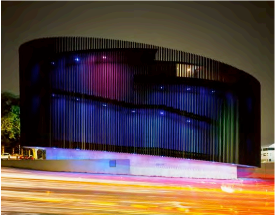
Plate 38: Exterior – Circa Gallery on Jellicoe, Johannesburg, July 2010