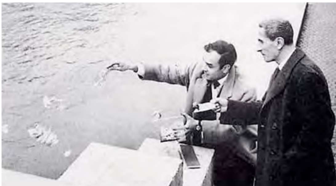
Plate 3: Yves Klein, Immaterial Pictorial Sensitivity Zone 5 , 1962

Despite the incongruity, very few artists have resisted the urge to create some form of record of their performance activities, where their "survival and fame depends upon documentation" (Erickson, 1999: 99). Clausen states that this mutual dependency between performance art and documentation can be seen as a failure in terms of the initial ideology behind performance art, where performance art was "a projection surface for utopian and authentic desires" (Clausen, 2005: 9). For the egalitarian 'protest-hero,' the subjugation of performance art's ideological roots, through its reliance on documentation, is deeply paradoxical (Taylor, 2005: 43).