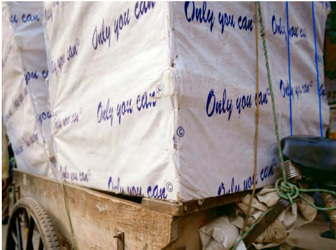
Plate 17: Bridget Baker, The Blue Collar Girl (Delhi), 2005 (frame 3)

Furthermore, The Blue Collar Girl is still very much rooted in performance art as a public enterprise. The performances are based in specific communities and are, to a degree, dependent on the peripheral action around them (Smith, 2006: 14). Thus, the final images remain open to the element of spontaneity and chance, ‘authentic’ shots of captured action (Baker, 2008). However, as with Official BB Leaf Project , rather than performing to a “mythicized... unified mass” – such as the grand gestures of Voina’s Palace Revolution – the work focuses on the creation of “momentary experiences,” a “one-to-one” relationship developed within a community, however “small” or “temporary” it might be (Bourriaud, 2002: 61 and Bishop, 2004: 54). Whether it be pedalling up a crowded street in Delhi, or sewing amidst ‘workers’ in Durban’s DavinScott Manufacturing Plant, the ‘Blue Collar Girl’ infiltrates the “local