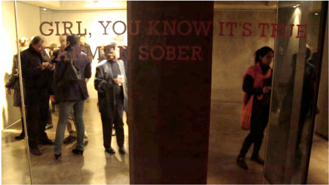
Plate 28: Girl, you know it's true , Circa Gallery, July 2010