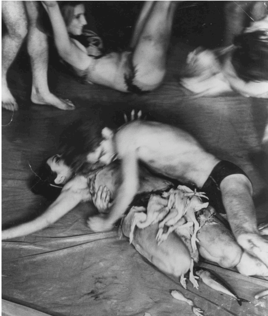
Plate 2: Carolee Schneeman, Meat Joy , 1964

McEvilley states that denunciation of art by “anti-art,” by painting through “anti-painting,” resulted in artists from the Kaprow/Schneeman generation positioning themselves as a “kind of dark alter ego of Modernism,” with many of the same characteristics, but with a “reversed hierarchy” (McEvilley, 2006: 138). With a focus on the prefix ‘anti,’ performance art developed an “anti-purist, anti-puritanical, anti-Minimalist, anti-reductivist, anti-formalist, anti-austere, anti-bare, anti-boring, anti-empty, anti-flat, anti-machine-made... anti-dogmatic, anti-exclusivist...” focus (Kozloff in Sandler, 1980: 346). Rather than creating an “instead of” or “in exchange for,” performance art