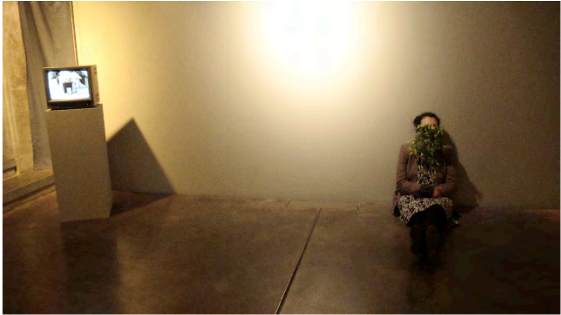
Plate 32: Installation – Pain and Seed , 2010