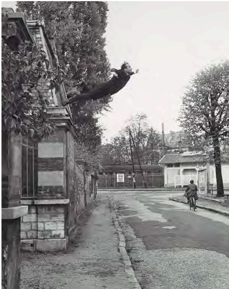
Plate 12: Yves Klein, Leap into the Void , 1960

He concludes that such a claim would be “absurd”: “of course the Beatles performed [their] music... and of course Yves Klein performed his jump” (Auslander, 2005: 30). As such, despite Nauman performing an ‘impossible’ act, the performance, within Auslander’s definition, is still a performance, “constituted as such through the performativity of its documentation” (Auslander, 2005: 30).