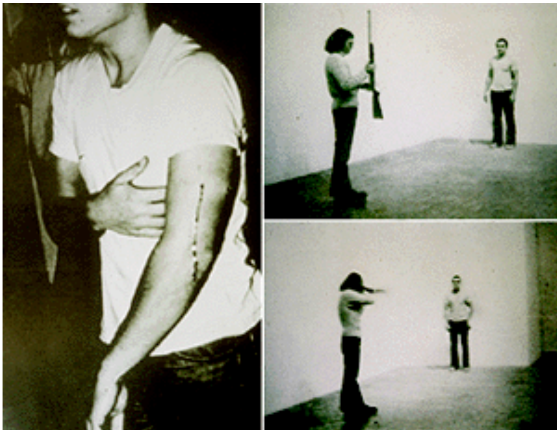
Plate 7: Chris Burden, Shoot , 1971

And indeed, there seems to be no real difference to the understanding of the work; the groundbreaking performance remains just that.