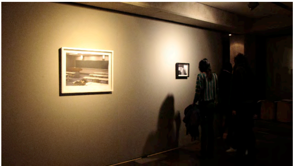
Plate 31: Installation – Pencil and Puppy , 2010