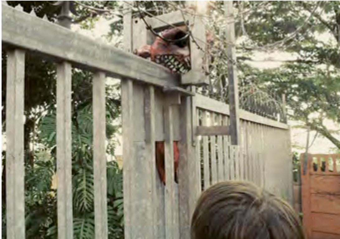
Plate 23: Carmen Sober, in collaboration with Lauren von Gogh, Fence , 2010

then digitally added in post-production. The final image (as with Puppy ) was printed on standard 8" x 12", on glossy paper, enforcing its reading as a 'genuine' photograph (see plate 23).