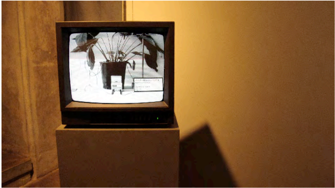
Plate 34: Installation – Pain , 2010