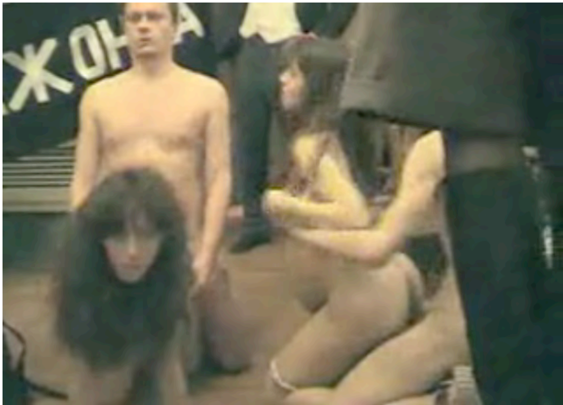
Plate 5: Voina, Fuck for the heir Puppy Bear! , 2008 (screen shot)