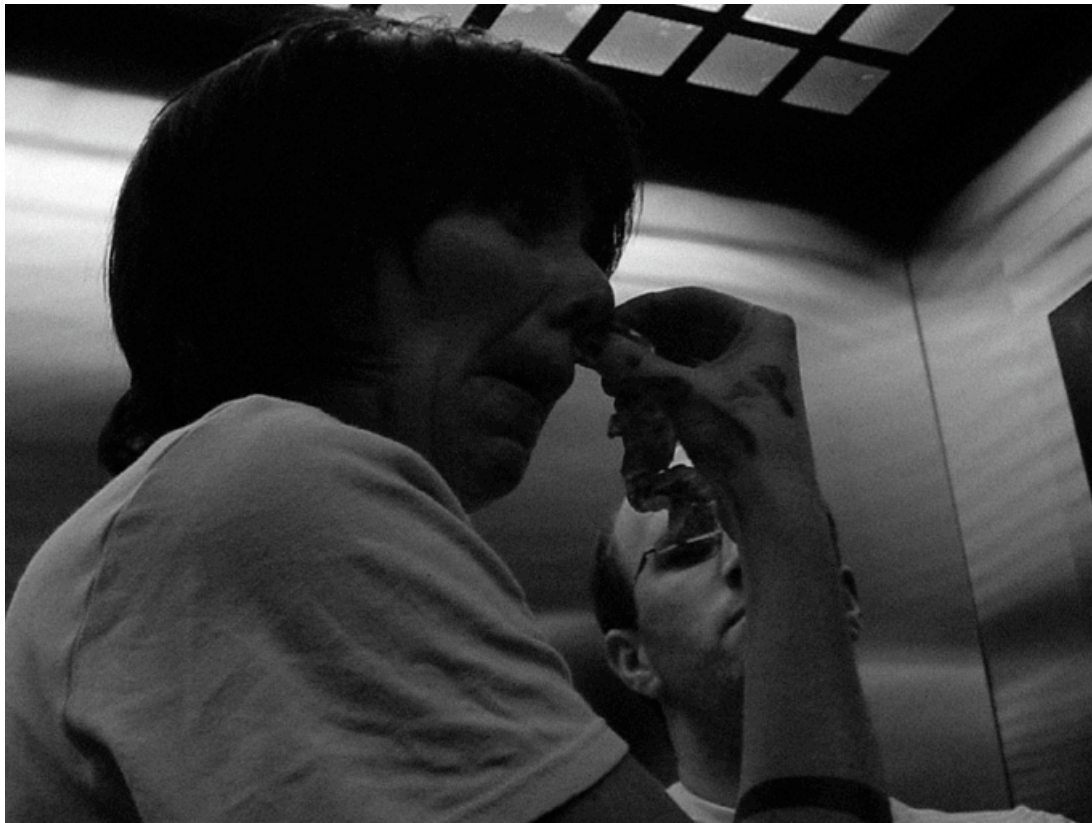
Plate 19: Sober&Lonely, Blood Elevator , 2005

In keeping with the ‘requirements’ of ‘traditional’ performance art identified in chapter one, the performance was focused on both the ‘live-ness’ of the ‘act,’ and the “collaborative participation of the audience” (Auslander, 2005: 27). In line with Baker’s Official BB Leaf Project , rather than a performance “lifted out... from its contextual surroundings,” where the performer is understood to be ‘on,’ Blood Elevator focused on the creation of “specific sociability,” and one-on-one encounters (Bauman in Auslander, 2005: 27 and Bourriaud, 2002: 16). However, unlike Baker’s ‘quiet acts,’ the situation posed was “disconcerting”; an uncomfortable violation of and encroachment into the integrity of the viewers’ space (Schneeman, 1980: 12).