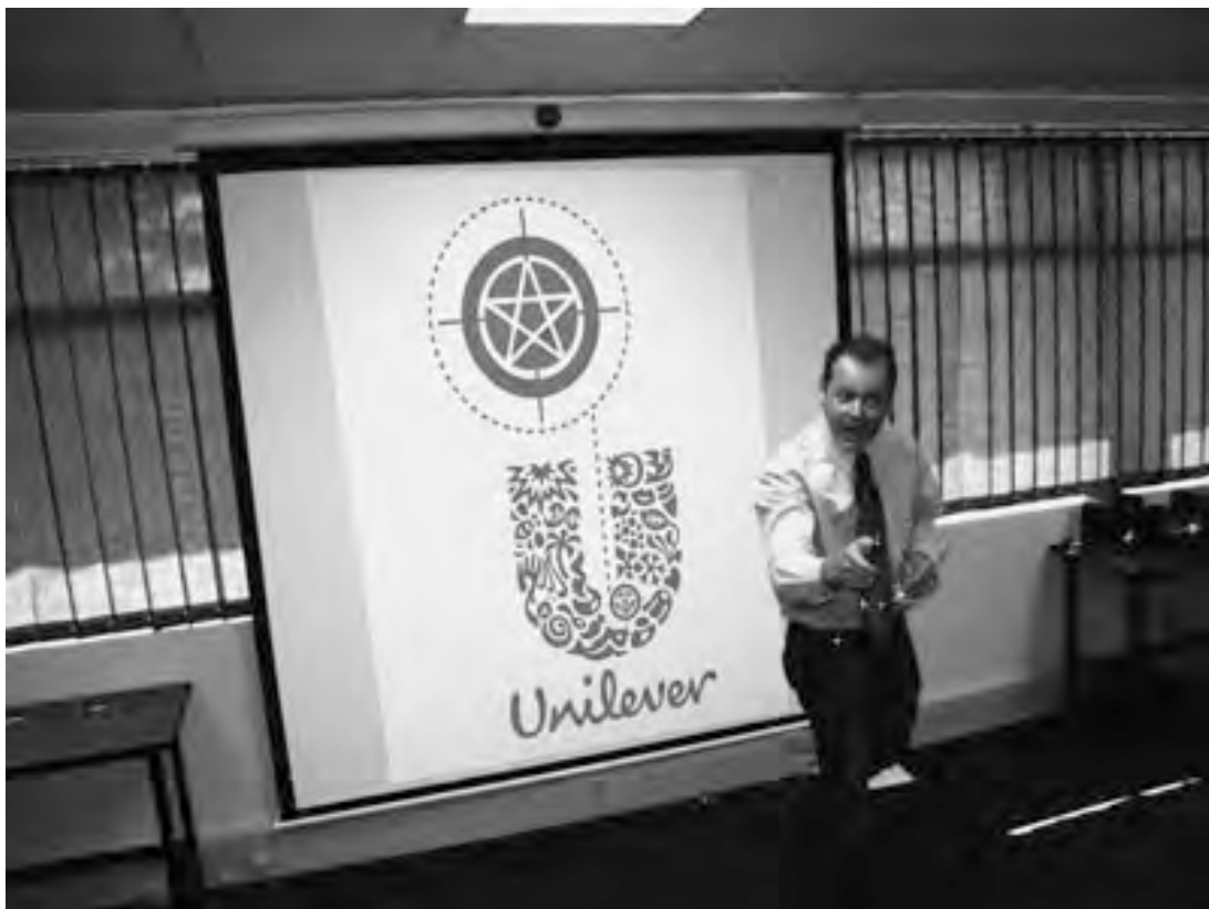
Plate 24: Carmen Sober, in collaboration with Clint Griffin, Trademark , 2010 (35mm projection)

viewer to realise that it is a choreographed event functioning as an allegory (Cotton, 2007: 51). However, despite the obvious absurdity of the image, and despite the ‘disclaimer’ in the paper that the exhibition explored “falsehood, fraud, lies and deception... that society can’t stop swallowing to the point of engorgement” the image was taken as ‘authentic’ (Sudheim, 2011). A few days after the publication, I received an email from the public relations department at Unilever asking “who is the man in the image?” and “where was the image taken?”, followed by a reproachful lawyer’s letter 52 . Clearly the contrived ‘authenticity’ had proved convincing.