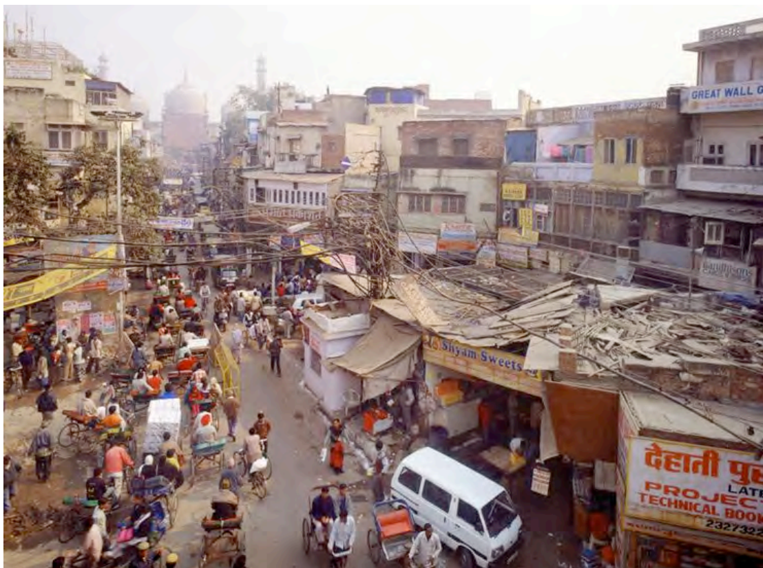
Plate 16: Bridget Baker, The Blue Collar Girl (Delhi) , 2005 (frame 2)