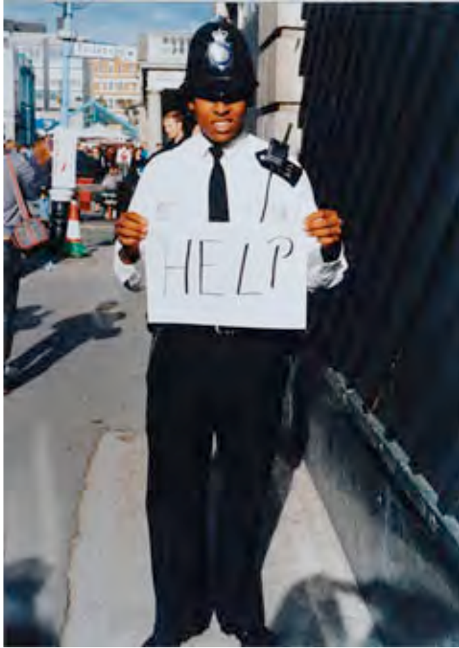
Plate 6: Gillian Wearing, Signs that say what you want them to say and not Signs that say what someone else wants you to say , 1993

Unlike the performance ‘traditionalist,’ Bourriaud states that while Wearing and other artists may have a preference for recording their acts via video or photography, they are not “video artists” (Bourriaud, 2002: 46). Rather, “the medium merely turns out to be the one best suited to the formalisations of certain activities and projects” (Bourriaud, 2002: 46). Further, Bourriaud states that “the manoeuvrability of video... means it can be used as a reified replacement for presence” (Bourriaud, 2002: 75). As such, Abramovic’s use of a video streaming to disseminate her work The Artist is Present seems more in line with the idea of ‘presence’ than posited by the more fundamentalist critic. Under the banner of ‘Relational Aesthetics,’ the ‘objects’ – videos, texts