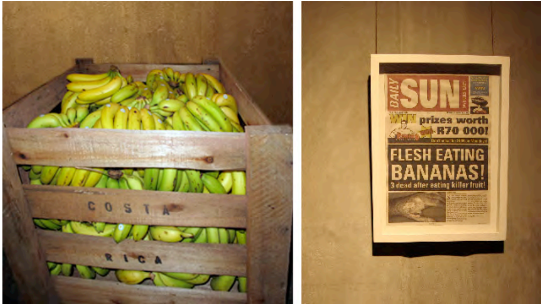
Plate 26: Carmen Sober, Banana I and II , 2010

For Hook , I attempted to shift an ‘encounter’ completely away from the gallery space, to a collaboration that might or might not occur, might be responded to, or not. While the audience was in the gallery, I slipped a ‘handwritten’ note under the windshield wiper of each of the parked cars, stating: “I saw you drop a R200 note... call me I’ll come drop it off at your house – 0793479908. Love Cedric” (see plate 27).