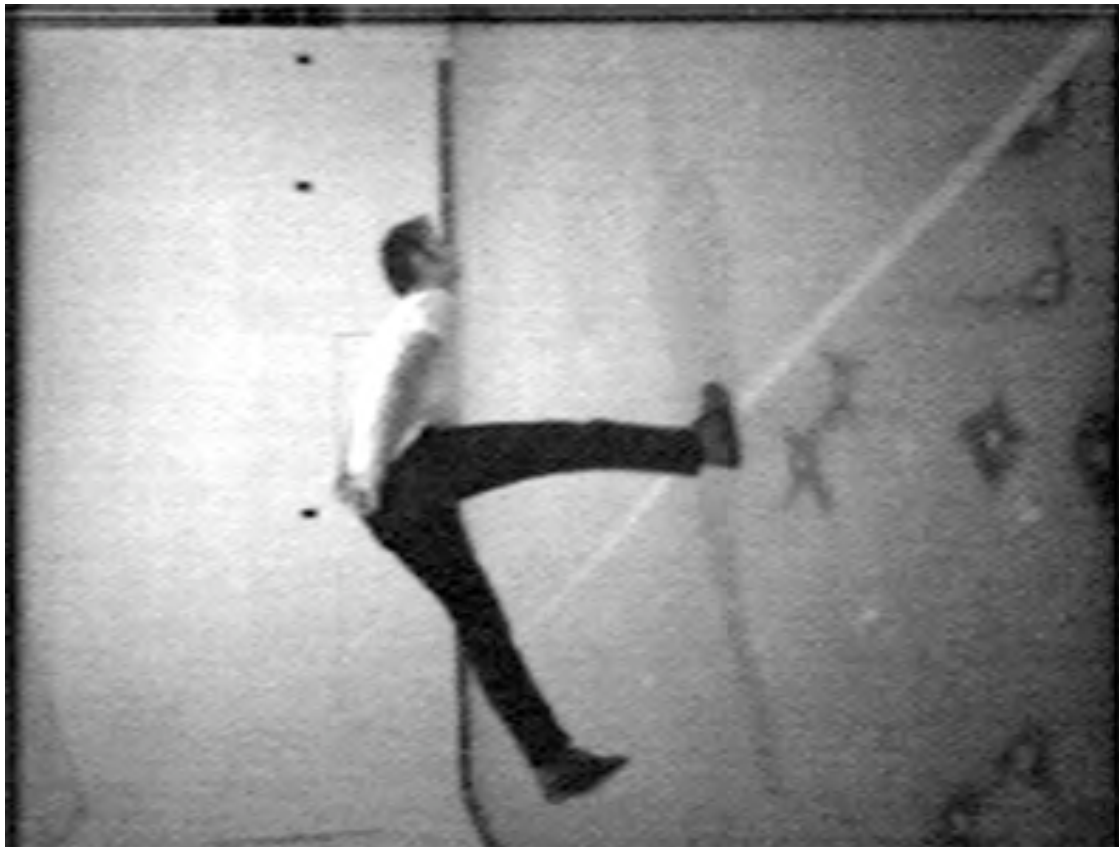
Plate 11: Bruce Nauman, Slow Angle Walk , 1968

on a square drawn on the floor, alternating between bending his torso down or leaning back” (Archer, 2002: 100) (see plate 11). However, rather than creating a realistic sense of the space, he utilises the camera to create an illusion within the production of the work. By placing the camera upside down, or angling it at ninety degrees, Nauman creates a filmic ‘special-effect,’ where his body seems to perform logically impossible acts such as walking up a vertical wall (Archer, 2002: 101).