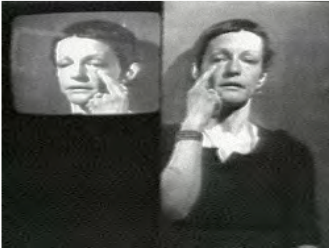
Plate 9: Joan Jonas, Left Side Right Side , 1972