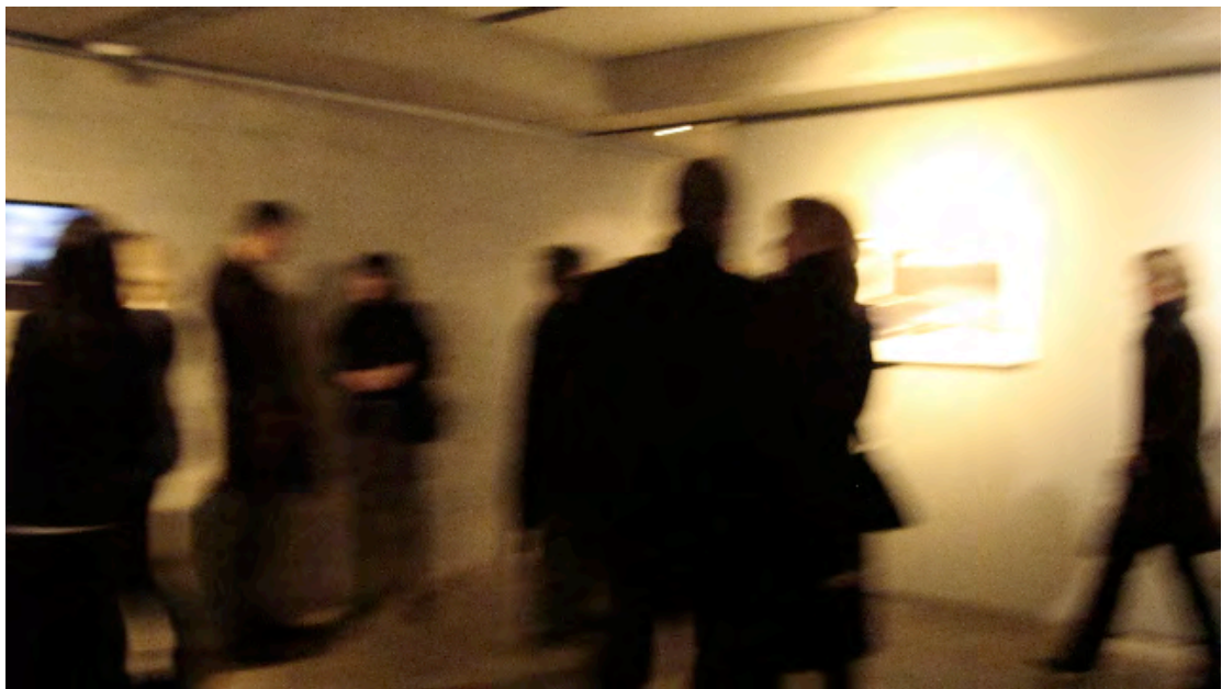
Plate 37: Girl, you know it's true , Circa Gallery, July 2010