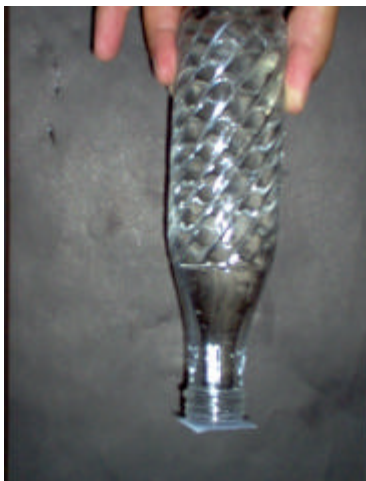
Figure 3: Bottle filled with water, a piece of paper slipped over the top and then inverted