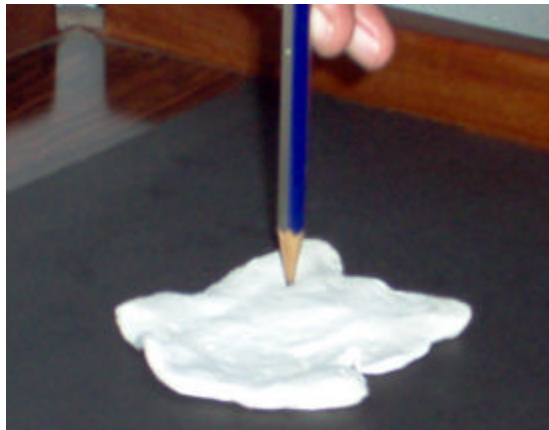
Figure 1a: Sharp-pointed pencil pressed down directly into the soft clay