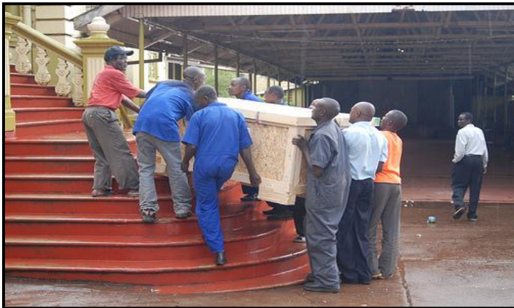
Delivering scanning equipment to the National Library of Uganda