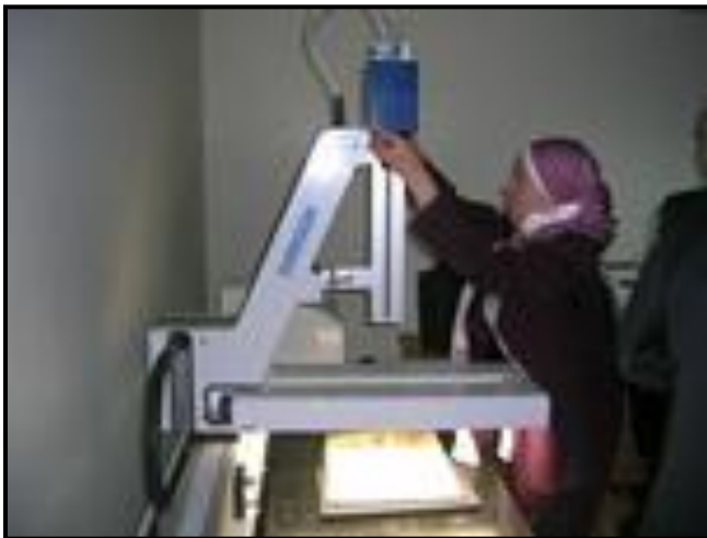
Newly trained staff at the National Library and Archives of Egypt