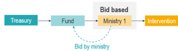
Figure 3. Bid-based SDG accelerator awards