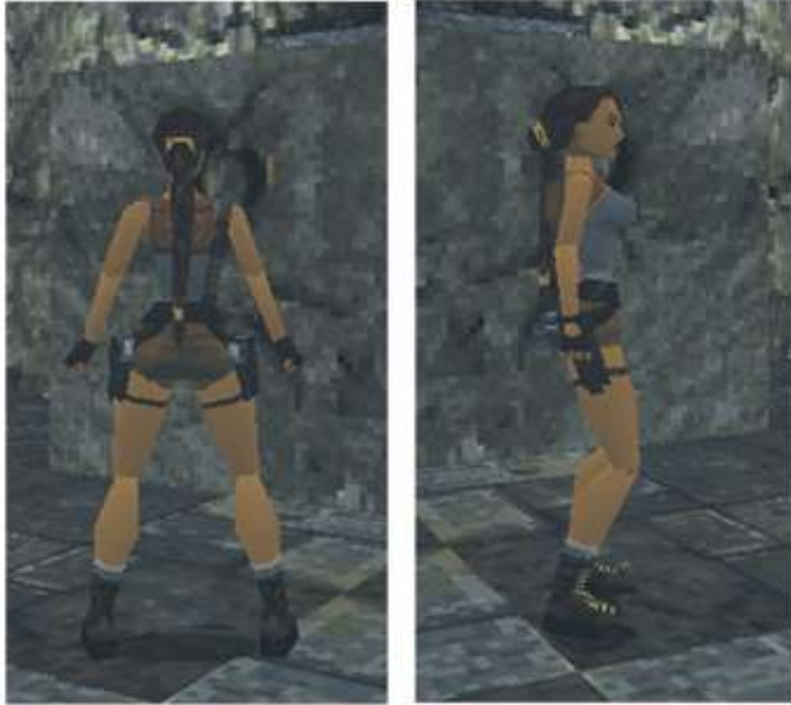
Figures 9 and 10 Screenshots from Tomb Raider 2 – The Golden Mask