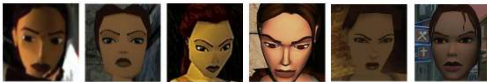
Figures 19 to 24 A series of screenshots showing Lara's face as it develops through the game sequels. 28

Facial comparison of Lara Croft in the games Tomb Raider 1 to 6 is provided in Figures 19 to 24 below.