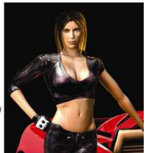
Figures 26 to 29 Earlier character concepts through to final rendering 42