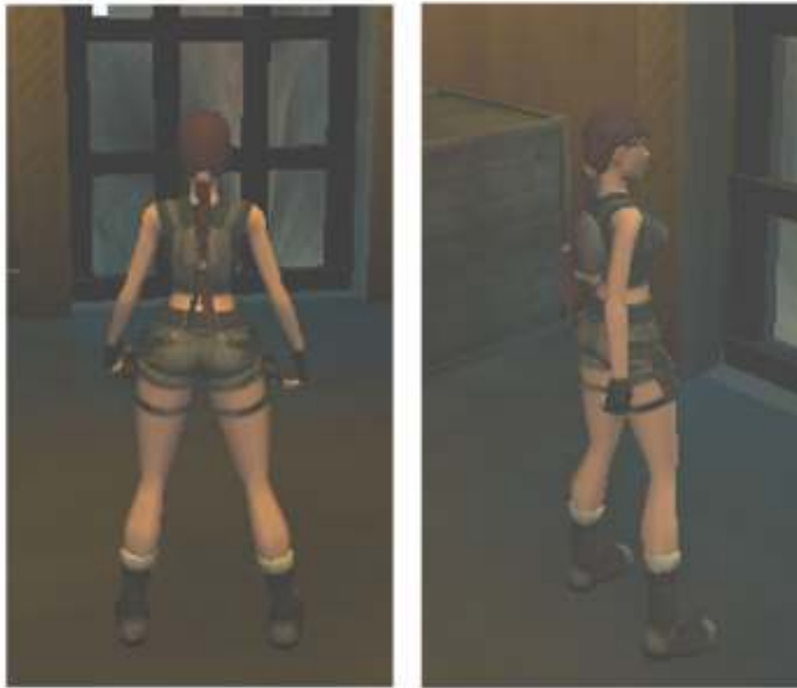
Figures 17 and 18 Screenshots from Tomb Raider 6: Angel of Darkness