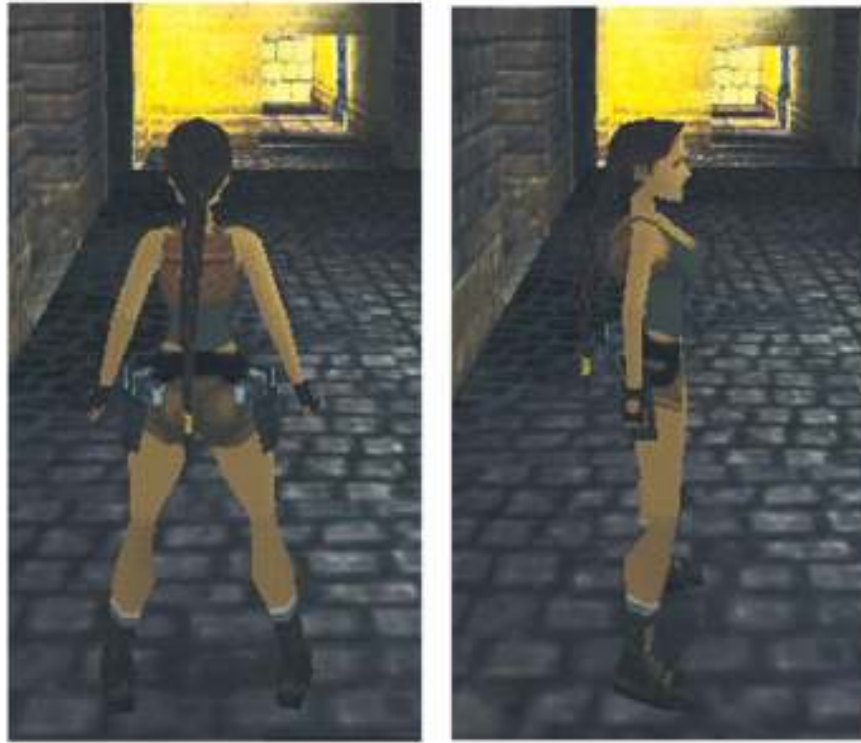
Figures 15 and 16 Screenshots from Tomb Raider 5: Chronicles