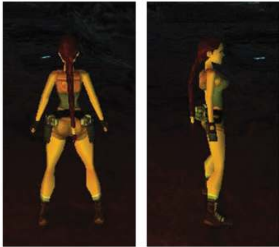
Figures 13 and 14 Screenshots from Tomb Raider 4: Last Revelation