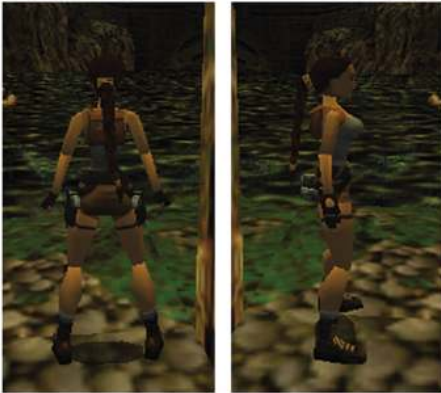
Figures 11 and 12 Screenshots from Tomb Raider 3: The Lost Artefact