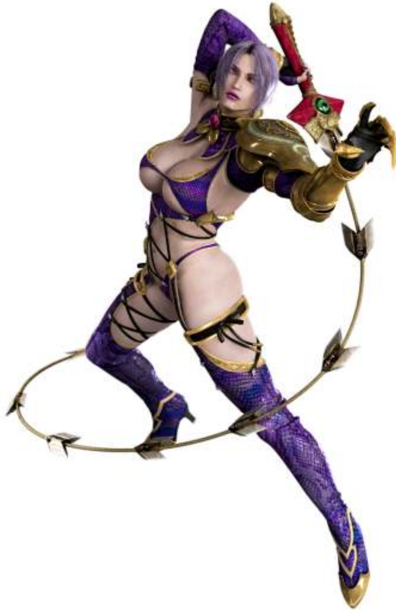
Figure 3 Ivy from Soul Calibur