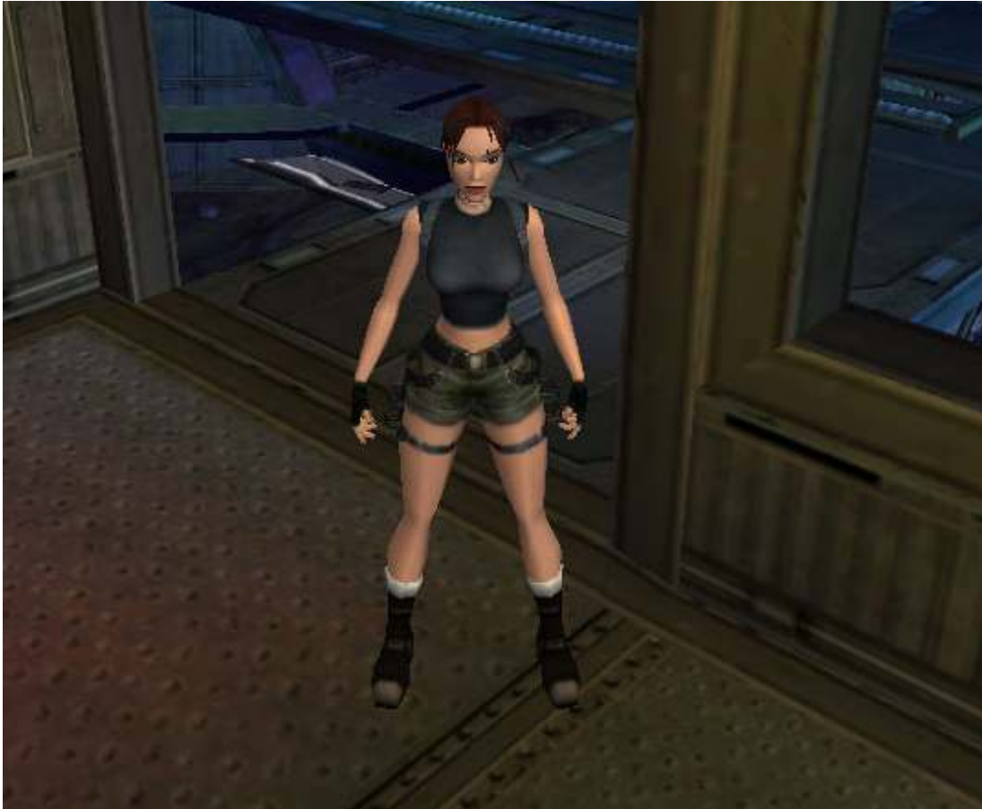
Figure 1 Screenshot from Tomb Raider 6 – Angel of Darkness