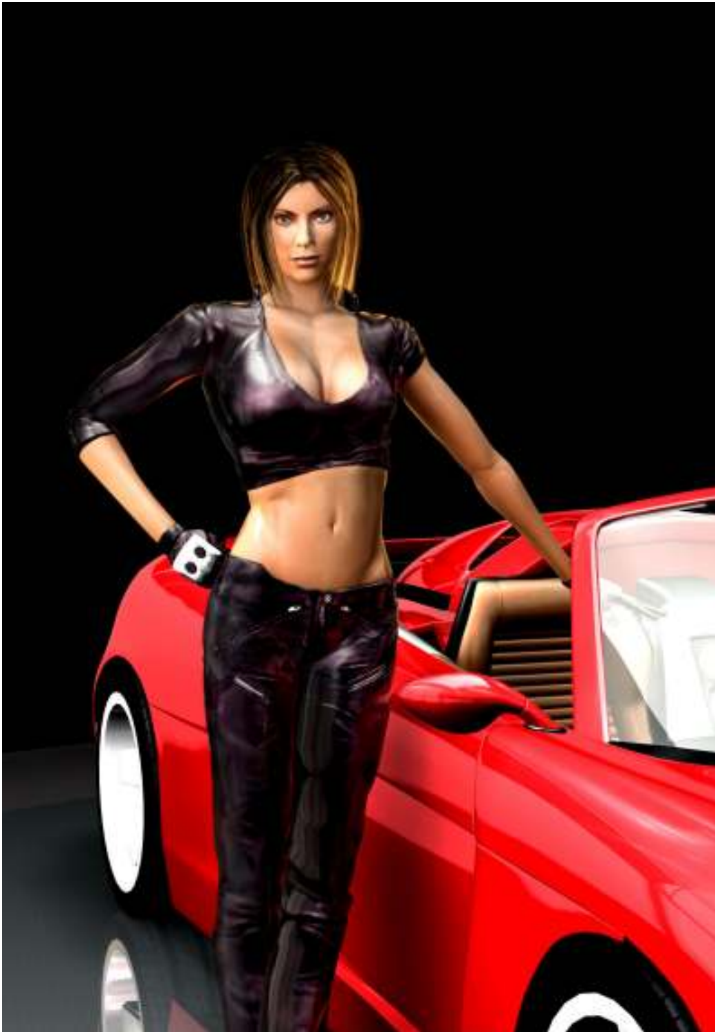
Figure 25 Chase featured in NAG Magazine