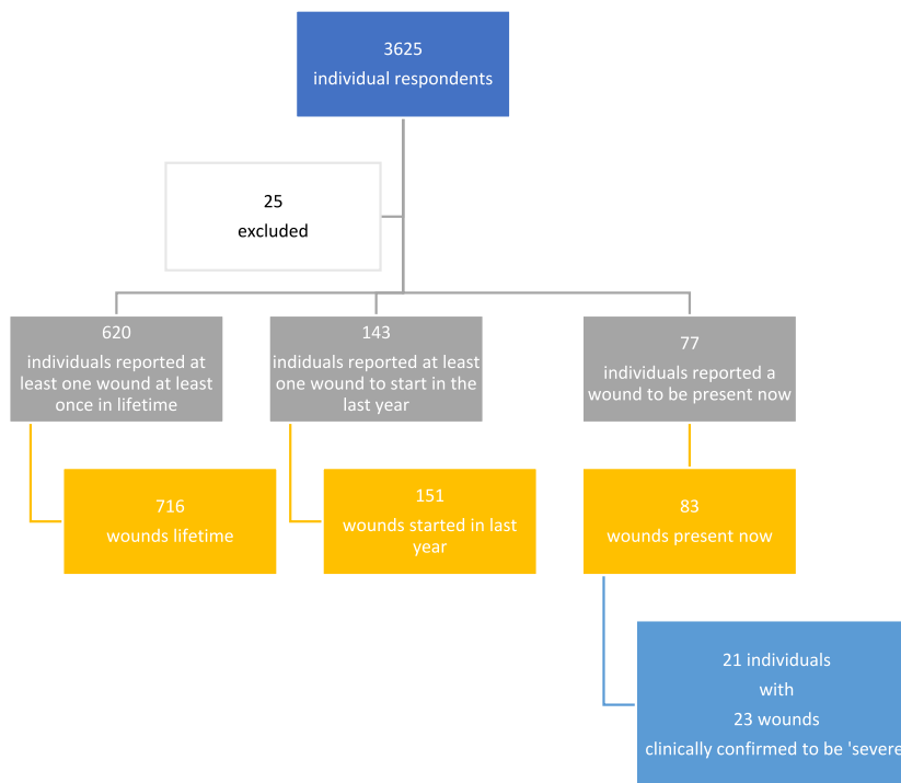
Fig. 1. flowchart of respondents and wound numbers.

two children, with a median age of 32 years. Ten (66.7 %) deaths were due to an RTA, two due to a trauma with a hot liquid, and one due to a fall. With a mean size of the households of 5.2, the reported rate of deaths due to a wound or burn is 146 (95 % CI 85–242) per 100,000 population per year. This leads to an estimated 11,021 (6416–18,268) people dying from wounds every year in Sierra Leone.