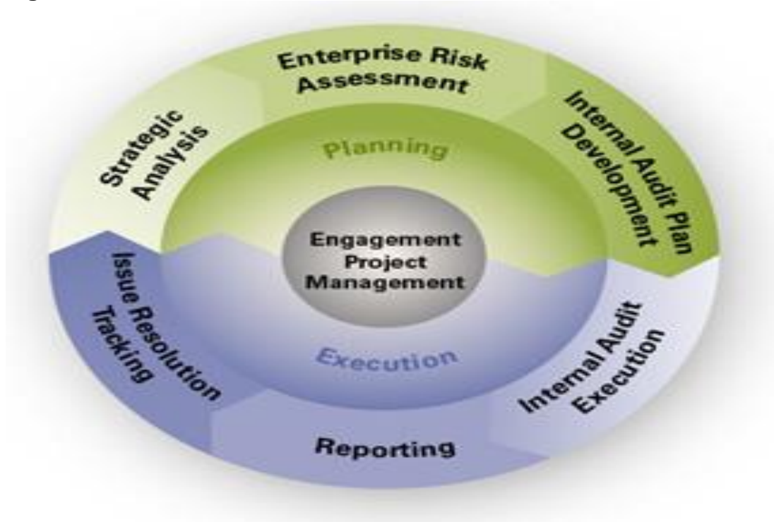
Figure 3 - Internal Controls Transformation

Afrimat (2015) says companies can outsource certain audits to external service providers, the control self-assessment tool provides a mirror on the adequacy and effectiveness of the organization in controlling its activities and its risks.