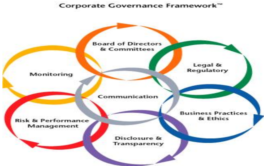
Figure 2: Corporate Governance Framework

governance operating model. Clear communication of the processes, roles and responsibilities is the glue that keeps the systems functional (Orton, 2010).