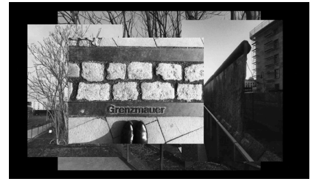
Figure 4: As I walk through Berlin I am always conscious of where The Wall once stood. As I stand on the edge I contemplate how people's lives were shaped and affected, depending on which side of the wall they were standing.

As this section focuses on me, the images are taken from my entire journey as I incorporate images that 'remember' my generational past as well as images from the city of my birth, Johannesburg. At this point in the film, I ponder with each step I take how the city was once segregated. As I walk the streets, I remember those who came before me and consider their experience within each domain but from a different moment in time. I come back to the concept and image of the train because it plays such an important role. Johannesburg is a mining city and the train has always