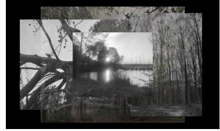
Figure 5: Nature is my guilty landscape as she remains bold, beautiful, alluring and serene, yet my relationship with her is ambiguous, enticing, hesitant and uncertain. The edit throughout the film is layered with overlapping images as a visual reminder of the different threads of memory.