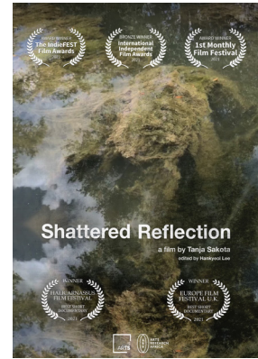
Figure 2: The official poster for my film Shattered Reflection . The film traces my journey as I engage with fragments of memory across three generations. The visuals focus on objects of memory which are my pieces, shards and snippets of evidence of the past. The reflection of the sky in the river in the poster replicates my experiences as I look at the shattered reflection of my life.

The only understanding of the event available is through the memory inhabited by the site itself. This leads to the question of how one engages with a setting and how its design and construction can be used as a conscious provocation. How does the architecture of a site generate memory and how is the past manifested in the architecture of memory?