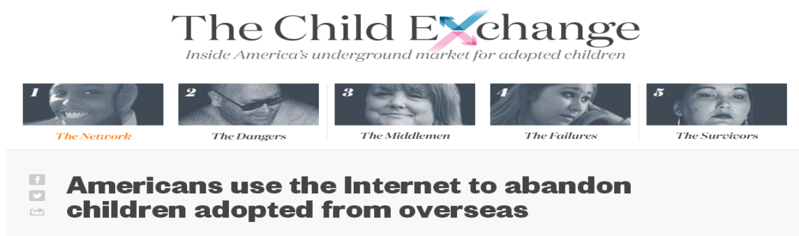
Figure 3 Snapshot of Reuters Investigates: Child Exchange series

( http://www.reuters.com/investigates/adoption/#article/part1 )