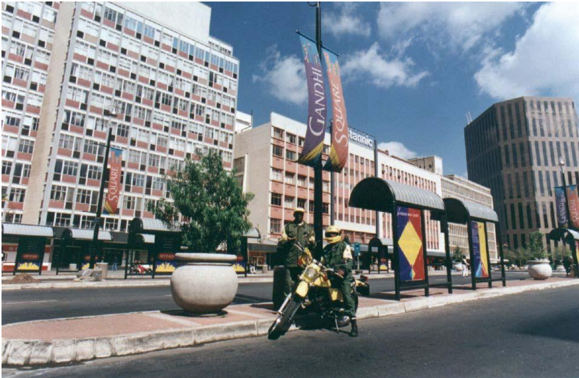
Figure 1: Upgrading and providing security in Ghandi Square

property owner wanted to address the issues of homeless people, street children and petty crime because of the negative impact on the area. In response the CJP established a consortium consisting of the majority of property owners contiguous to the Square. A lease agreement over the Square was negotiated with the Council that required the consortium to upgrade the Square and maintain it at their cost. The consortium named the Square after Gandhi in recognition of the significant role that Mahatma Gandhi played in Johannesburg. When the project was completed in 1999 the CJP retained responsibility on behalf of the Consortium for maintain and managing Ghandi Square.