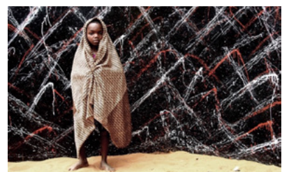
Figure 12. Note the Vodun mural by Noble Kunyegbe as a young child poses in front of Tɔgbui Adzima Shrine wall, Klikor, Volta Region, 2016.