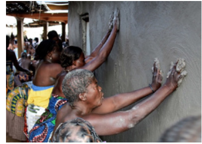
Figure 6. Kli-Adzima devotees in the process of “ bailli ” (plastering the shrine walls with sacred kaolin), Klikor, Volta Region, 2016.

Primarily, modern art is created through an array of subliminal creative processes, operating below the level of consciousness. It evokes in us primal instincts, deep