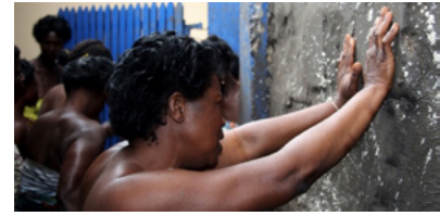
Figure 8. Vodun devotee in a contemplative pose making her final supplications on the finished “ bailli ” masterpiece mural, Klikor, Volta Region, 2016

In recent times, urban Ghanaian modern artists re-emphasise Ghana’s culture through their creative works. First of all, there are those who have successfully repositioned Ghana’s own cultural symbols as successful artistic tools, explored these, and given them personal and new modernist twists in diverse styles. Some major, early generation “formally trained” Ghanaian modern artists include Ablade Glover, El Anatsui, Grace Atta, Kofi Antubam, Kwami, among others. These artists and several others recreated Ghana’s entire culture by appropriating old forms and reinventing them into refreshing cultural expressions. They are engaged in constant communion with both the past and the