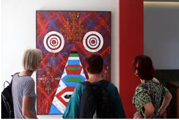
Figure 13. A group of German academics appreciating Shaka's Military Reforms , as part of my exhibition in Accra, 2017, photograph by the author/artist.