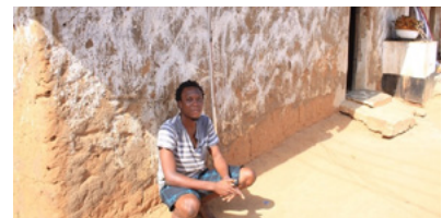
Figure 11. Researcher posing near a variation of Modernist soak-stained mural on the mud walls of Tɔgbui Adzima Shrine in Torgodo, Volta Region, 2016, photograph by the author's research assistant.

Indeed, ever since I began to experience this “spiritual paradigm shift” as an artist, I most often feel the urge of the creative spirit flowing through the inner depths of my very soul. This enlightening research has broadened my creative vision and exposed me to an endless supply of creative essence and spiritual expressions, into which I could tap and explore, and create my own unique aesthetic values in future art exhibitions.