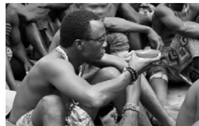
Figure 3. Researcher participating in the communal drinking of sacred Aliha at the sacred grove of Tɔgbui Adzima Shrine in Klikor, Volta Region, 2016, photograph by the author's research assistant.