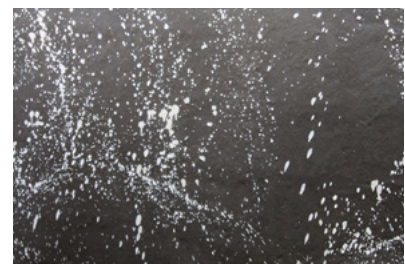
Figure 10. Close-up shot of “ bailli ” mural on Mama Vena Shrine wall, Ablgame, Klikor, Volta Region, 2016, photograph by the author.