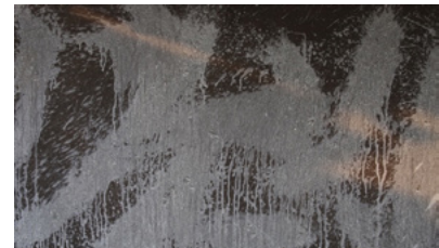
Figure 9. A finished modernist “ bailli ” mural on Kli-Adzima Shrine wall. The spontaneous splashing, soak-staining, dripping, and sprinkling of edza (a millet-based solution) produces interesting accidental effects and highly sophisticated artistic results. Klikor, Volta Region, 2016.