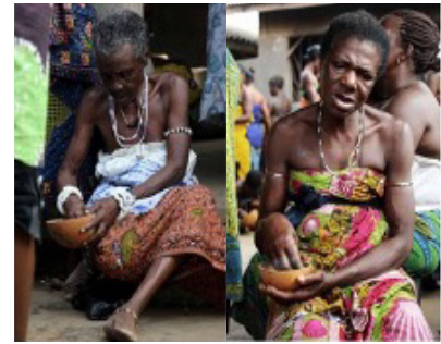
Figure 5. Kli-Adzima devotees pulverising sacred kaolin (mixed with sacred water) into a fine paste while waiting for their turns to plaster the shrine walls, Klikor, Volta Region, 2016, photograph by the author.

I realised very early on that the philosophy behind Vodun art is inextricably linked to the guarded esoteric secrets shared exclusively among the Vodun priests, spirit mediums, and some leading members of the various Vodun shrines. Sacred barriers and religious exclusivity posed a huge challenge in accessing not only important gnosis but also entering certain ritual domains to access information. In a typical ritual space like a Vodun shrine, artistic elements are required and employed in performing almost all religious rites and ceremonies. In a technical sense, the priests, the performers, and the devotees display a heightened awareness of the arts and apparently adhere to religio-aesthetic principles ordained by the deities. They also display creativity in diverse ways. I gained in-depth knowledge about the religious concepts and philosophies associated with Anlo-Ewe Vodun art and aesthetics.