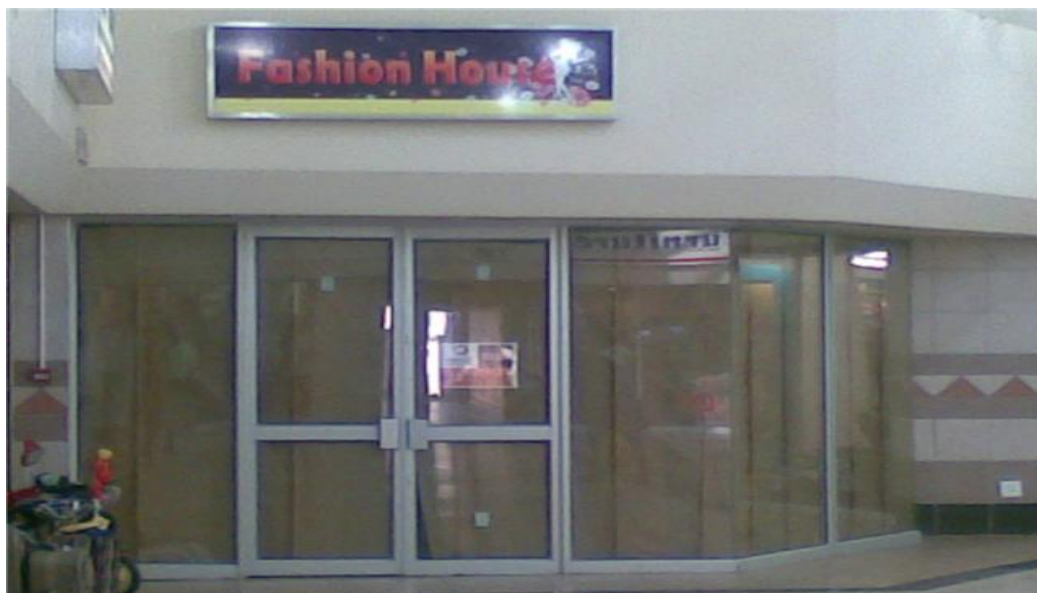
Figure 5: Closed down shop In Bara Mall due to high competition

The chairperson of Sobico felt the rent was just one of many reasons why locally owned businesses closed down. Other reasons included high competition and lack of demand for their own products also played a crucial role. He further explained that “they tended to be selling the same products that are sold in mega outlets and hence people preferred buying groceries from Shoprite since they were cheap and most probably fresher”. The managing director of Landmark also felt that the rent was not the only reason why the locally owned businesses closed within the Mall. He noted that they closed down due to the lack of business acumen, cash flow and marketing and selling of the same products that are sold by the big retailers at a cheaper rate. Mavundla who is the chairperson of African Co-operative for Hawkers and Informal Businesses (Achib) was quoted by Bisseker (2006) outlining a number of reasons why informal retailers do not grow. He states that they do not grow because of the lack of business and retail merchandising knowledge, which includes a lack of access to finance, and their inability to get volume discounts from wholesalers.