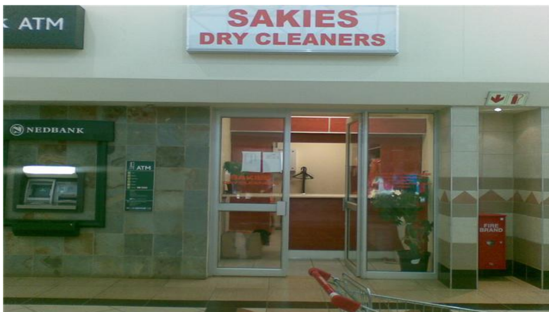
Figure 4: One of the locally owned businesses within the mall

In order to ensure transparency, the LED unit manager always sat in the interviewing panel of the hiring company in order to ensure that it they employed local people and used local businesses for any construction job. The managing director of Landmark supports the Soweto LED Unit manager by stating only locally based people were employed during the implementation of Bara Mall and that the material used was locally produced. Furthermore, the principal contractor subcontracted locally based companies. According to the managing director of Landmark also pointed out that their use of local people in the implementation of Bara Mall was to fulfil Landmark's vision that seeks to ensure that local communities are empowered and benefits from their developments. Furthermore, when the Bara Mall was ready for operation, about 35% of local businesses owners were afforded space within the Mall.