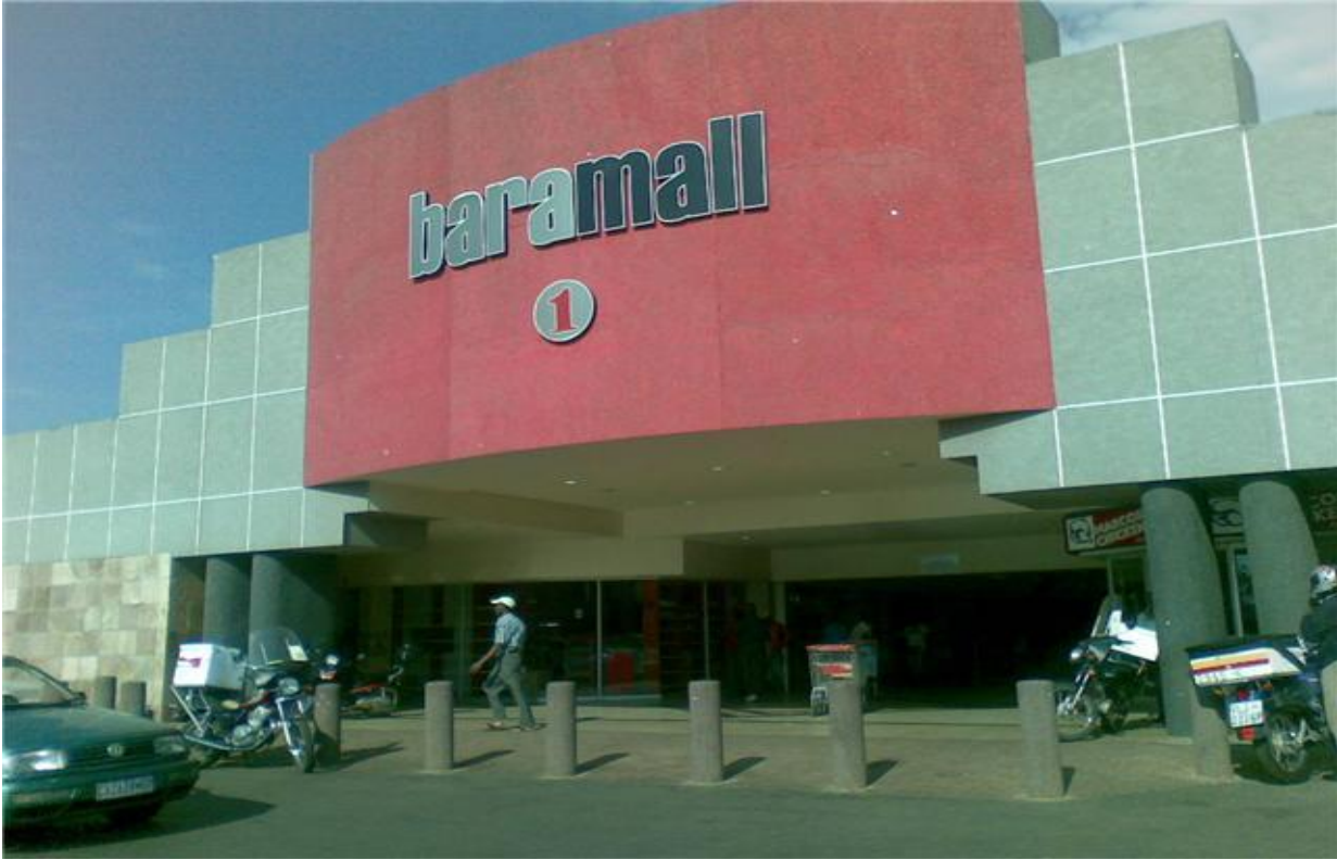
Figure 3: Bara Mall