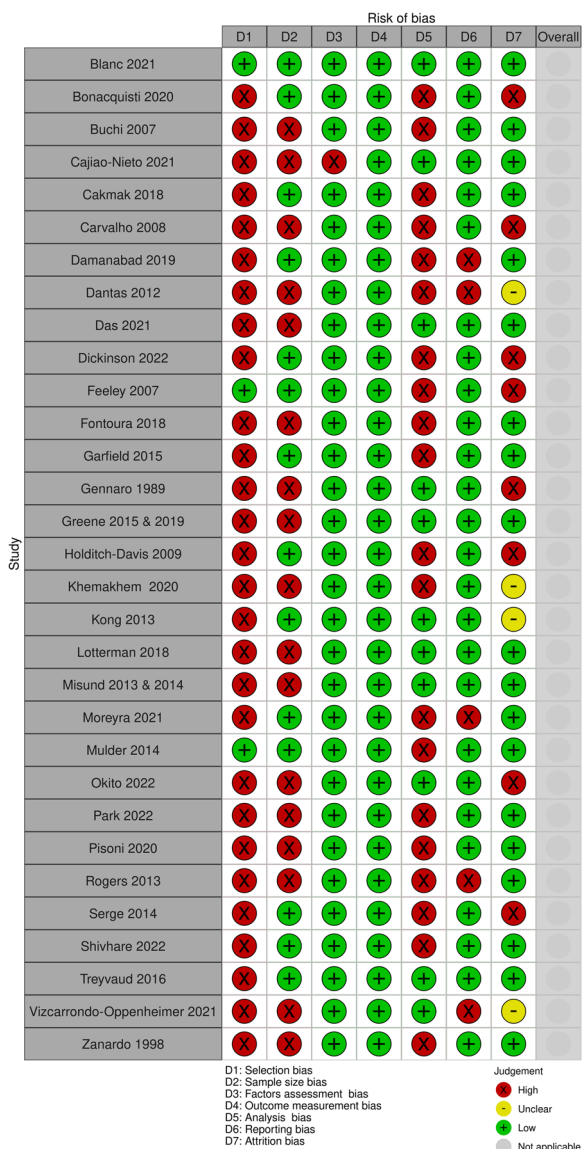
Fig. 3 Risk of bias summary of anxiety included studies

five studies [47, 62, 63, 69, 78] and attrition bias was low in all except in eight studies where it was high [31, 57, 61, 65, 67, 70, 75, 76] and unclear in four [62, 73, 74, 78].