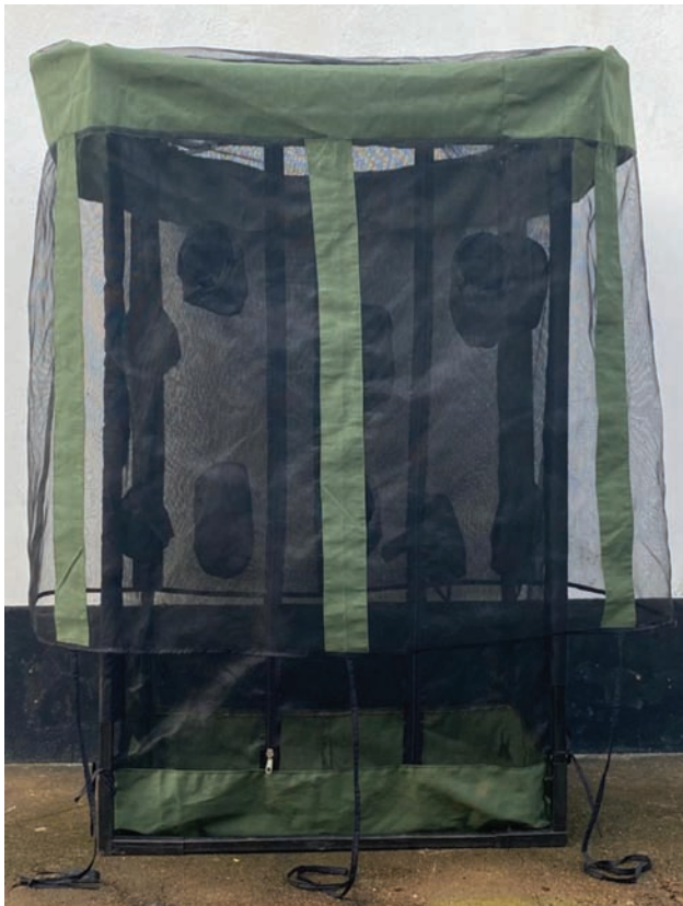
Figure 2. Miniaturized double net trap (DN-Mini) used for sampling host-seeking malaria vectors indoors and outdoors. Detailed description of the DN-Mini is provided by Limwagu et al [46]. The trap allows exposure-free assessment of human biting risk, yielding comparable diversities of mosquito species and physiological states, even though actual densities collected are significantly lower than in standard human-biting collections.

in particular tends to bite outdoors when they are older but indoors when they are younger [46]. When the adult females were dissected by Limwagu et al [46], they observed that although An. arabiensis mostly bit outdoors, their older and potentially infectious subpopulations were mostly outdoors. Overall, the available evidence suggests that an effective indoor intervention could tackle both the indoor proportion and outdoor proportion of the main malaria vectors [46, 70].