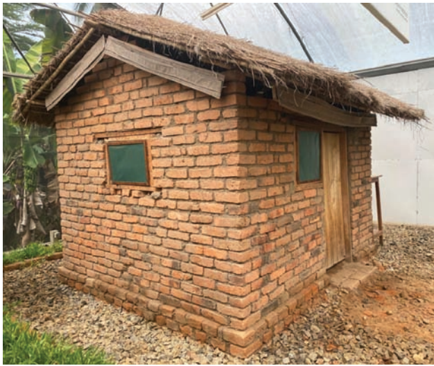
Figure 4. Eave ribbons fitted around the eave space of houses are potentially effective as a complementary intervention against outdoor- and indoor-biting mosquitoes. Detailed description is provided by Mmbando et al [35].

both indoors and outdoors, and can be fitted to nearly most houses without completely sealing eave openings. Evidence from experimental hut studies [35] and field studies in migratory households in Ulanga district [30] demonstrated significant efficacies against An. arabiensis and An. funestus . Other studies have also showed that even nonusers can be protected [50]. Where people spend significant periods of time outdoors in their peridomestic spaces, the ribbons can also be affixed to chairs and outdoor kitchens to complement ITNs [92].