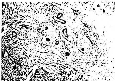
FIG. 5.—Low power view of histological section of tumour showing fibrous tissue whorls enclosing ducts and acini ( \times 64 ).