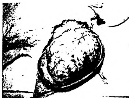
FIG. 2.—Tumour exposed showing subcutaneous position.