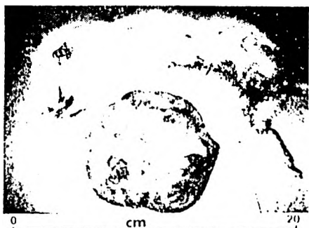
FIG. 3.—Postoperative appearance of rat and tumour.