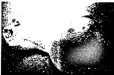
FIG. 1.—Preoperative appearance of rat and tumour.