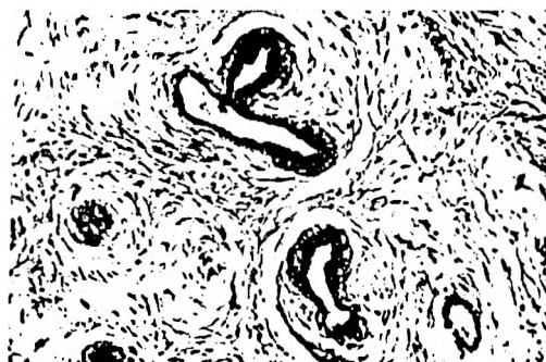
FIG. 6.—High power view of tumour showing ducts and acini with columnar and cuboidal cells ( \times 200 ).