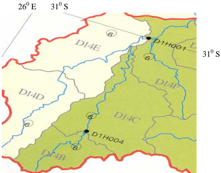
Figure A.2 Geographical location of streamflow gauges D1H001 and D1H004 Scale = 1: 1000 000