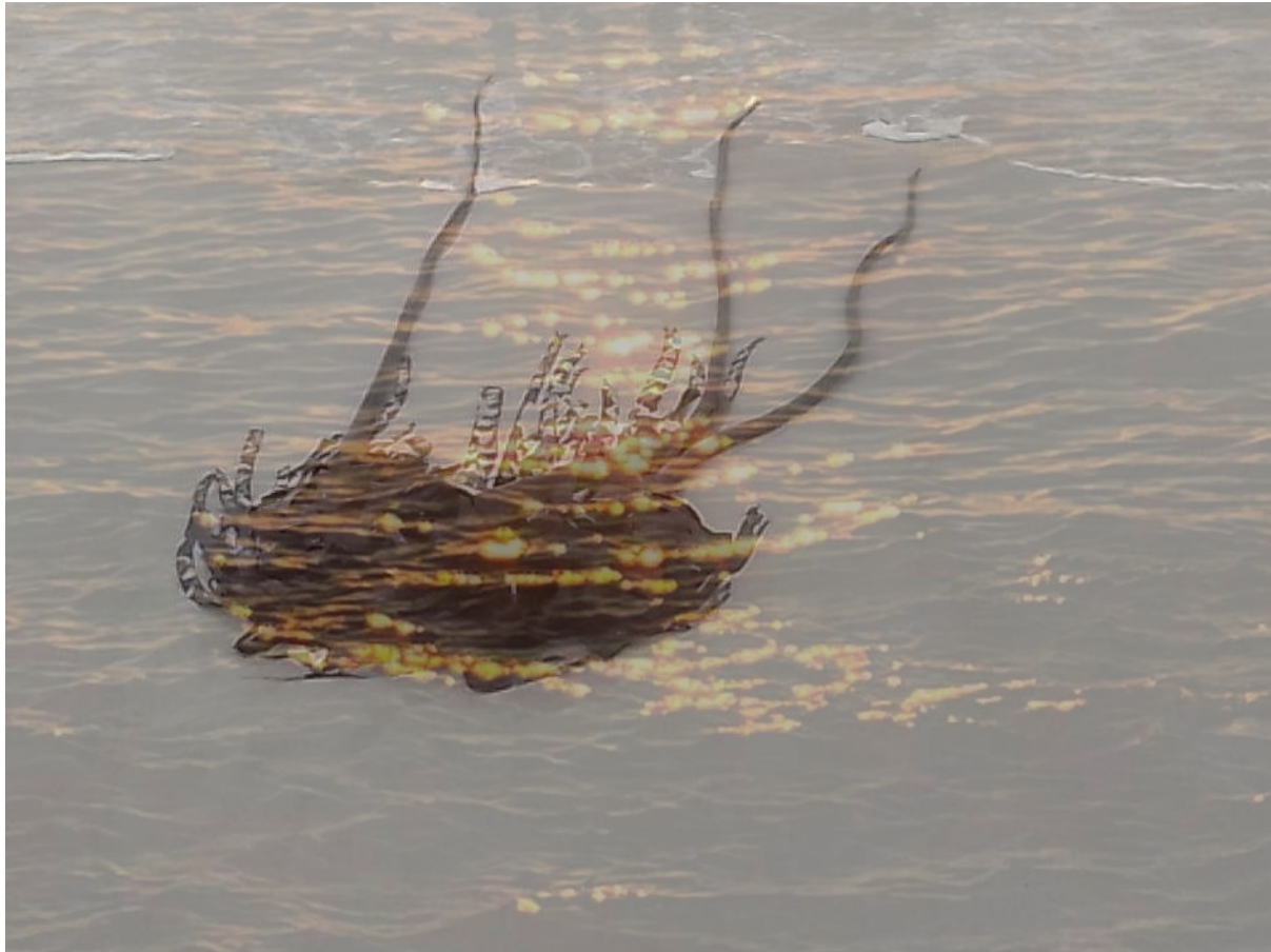
Figure 4. On the shorelines of kelp forested seas, such as the Atlantic Ocean by the Western Cape coasts of South Africa, you can find kelp branches washed up. Kelp can also be seen bobbing on the surface of the sea because even though kelp forests are largely underwater, this algae seaweed (heterokont) also needs to be close to sunlight. (Design: Manola Gayatri Kumarswamy)