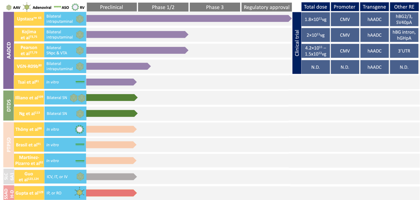
FIGURE 2 Summary of clinical and preclinical advanced therapeutics for IEM-NT. 3'-UTR, 3'-untranslated region; AADCD, aromatic L-amino acid decarboxylase deficiency; AAV, adeno-associated virus; ASO, antisense oligonucleotide; CMV, cytomegalovirus enhancer/promoter; DTDS, dopamine transporter deficiency syndrome; hAADC, human aromatic L-amino acid decarboxylase; hBG, human β-globin; hBG2/3, human β-globin partial intron 2/partial exon 3; hGHpA, human growth hormone polyadenylation signal; ICV, intracerebroventricular; IP, intraperitoneal; IT, intrathecal; IV, intravenous; N.D., not disclosed; PTPSD, pyruvoyltetrahydropterin synthase deficiency; RE, regulatory elements; RO, retro-orbital; RV, retroviral; SLC6A1, SLC6A1-related disorder (GABA transporter 1-related myotonic-astatic epilepsy); SN, substantia nigra; SNpc, substantia nigra pars compacta; SSADHD, succinic semialdehyde dehydrogenase deficiency; SV40pA, simian virus 40 early polyadenylation signal; vg, vector genomes; VTA, ventral tegmental area.

With the clinical precedents of NT gene therapies developed for PD, insights into vector design, dosage, delivery methods, safety, tolerability, and transduction of neural pathways are valuable for developing gene therapies for IEM-NT in the clinic. 60 The recent EMA and MHRA approvals of Upstaza™ for AADCD and recommendation by the National Institute for Health and Care Excellence (HST26) have further paved the way for the development and translation of these disease-modifying therapies. Here, we summarise preclinical and clinical gene therapy studies for IEM-NT (Figure 2) and discuss the potential future challenges in clinical translation.