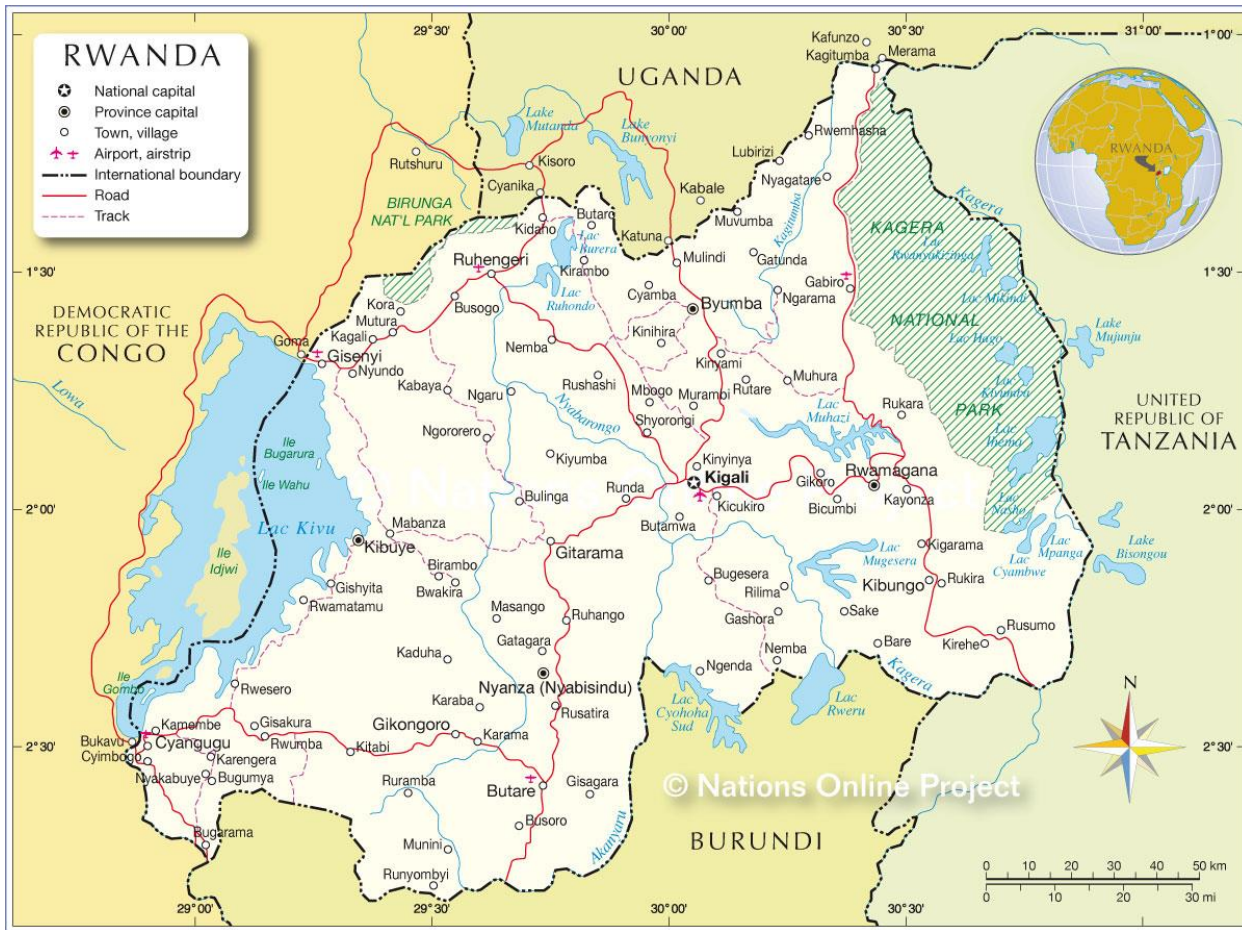
Map 1: Rwanda