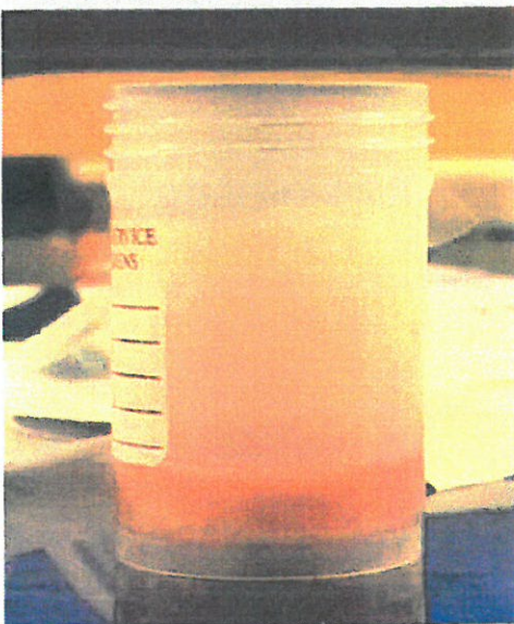
Figure 4. A sample of the red-brown coloured fluid aspirated from the abscess