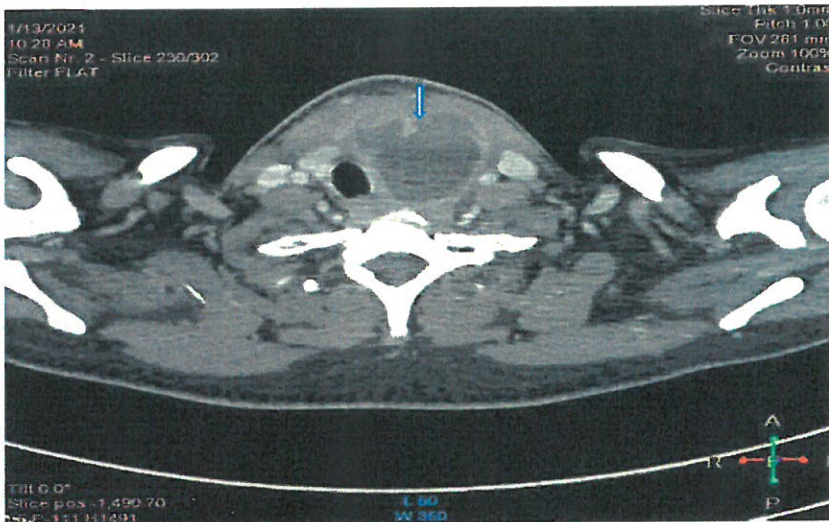
Figure 3. CT scan of the neck showing an enlarged, fluid-attenuated, necrotic mass (arrow) with minimal septation inseparable from the left thyroid lobe measuring 4.5×5.1×4.7 cm (AP×TV×CC). There was evidence of mass effect with deviation of the thyroid, larynx and trachea to the right, without compromising the airway. No underlying anatomic structural defect was found

Ultrasound-guided fine needle aspiration (FNA) aspirated 22 millilitres of purulent fluid (Fig. 4) and microscopy, culture and sensitivity (MC&S) grew Escherichia coli (Fig. 5) which was treated with piperacillin/tazobactam as per sensitivity. Repeat ultrasound showed minimal fluid not amenable to aspiration. Antibiotic therapy was continued until complete clinical resolution and an improvement in septic markers was seen. Urine MC&S was not performed and thus the source of infection remains unknown. We postulate that the cause could be a partially treated urinary tract infection caused by E. coli . Her follow-up visit yielded an unremarkable examination with normal thyroid function tests. A repeat ultrasound showed no residual collections in the left thyroid lobe.