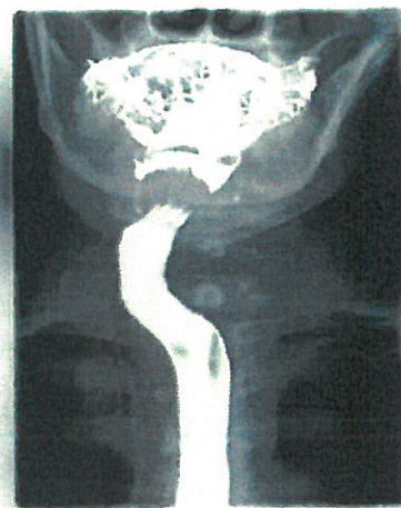
Figure 2. Barium swallow demonstrating anterior deviation of the oesophagus