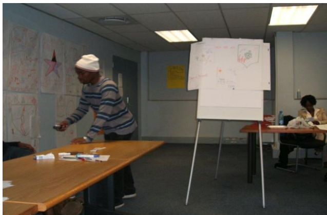
Figure10: A Typical Coat of Arms Presentation