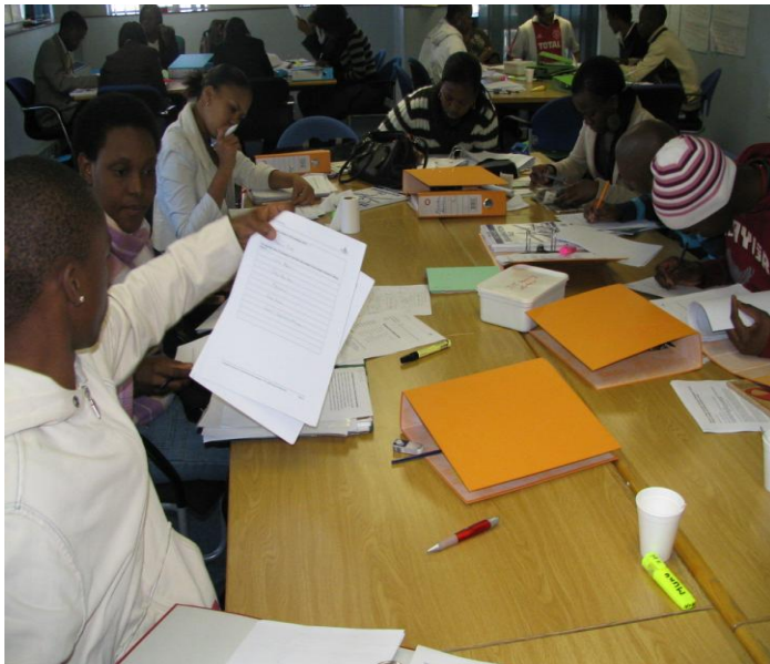
Fig. 9 Learners in the classroom

learning for a purpose and transformative learning which impacts on an individuals established frame of reference.