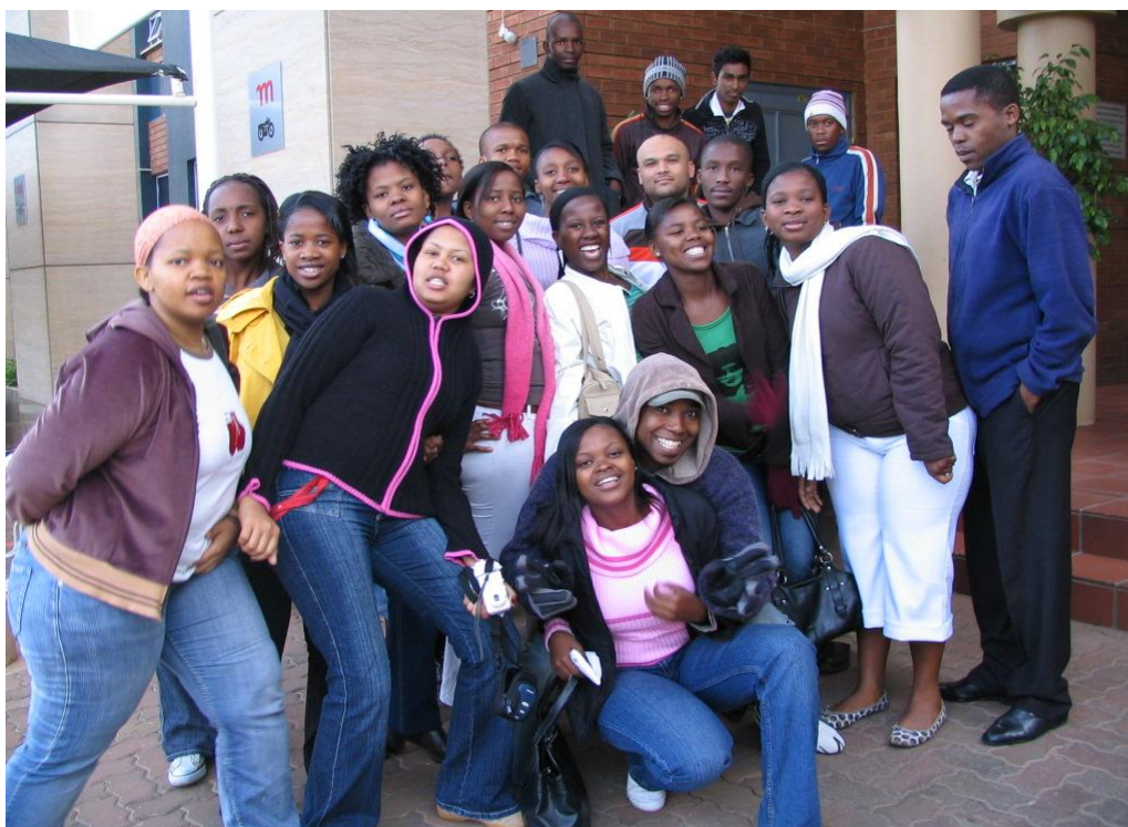
Figure 4: Learners visit the South African Mint