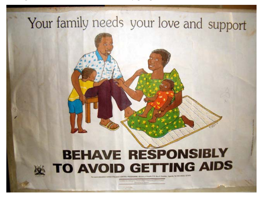
Figure 6.2. 'Behave Responsibly To Avoid Getting ADIS' poster, circa 1989. This poster was displayed in the Uganda AIDS Commission offices in Mmengo, Uganda, in 2003.

Worry'. The 'Love responsibly' poster became well known across Uganda and the slogans of these posters were still remembered by people that we interviewed in 2003.