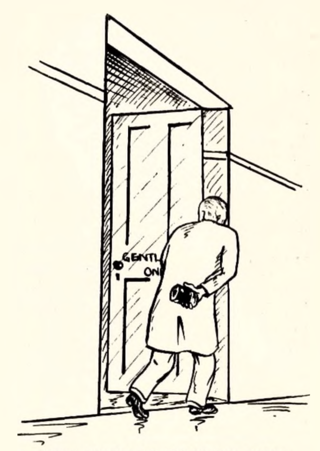
"THE PROFESSOR TAKES THE ROLL" is what we asked him to illustrate, and this is what he did.