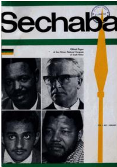
Sechaba Vol 1 no 1 January 1967