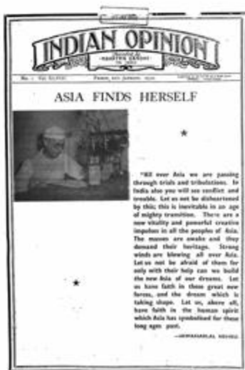
Indian Opinion Vol 48 no 1 January 1950

Over the years in-house research has been undertaken by the NLSA to meet the challenges of digital collection development. Topics of research included the legal deposit of web-based publications; an overview of digitization efforts in Africa; a review of existing South African policies and legislation in respect of digital preservation; and a survey of the establishment of digital libraries at South African tertiary institutions. In cooperation with seven academic libraries the NLSA took part in the LOCKSS-SA project: preservation caches for electronic journal content were installed at participating libraries. Research indicated that valuable groundwork was done in South Africa. Some South African academic institutions had well-established e-depositories.