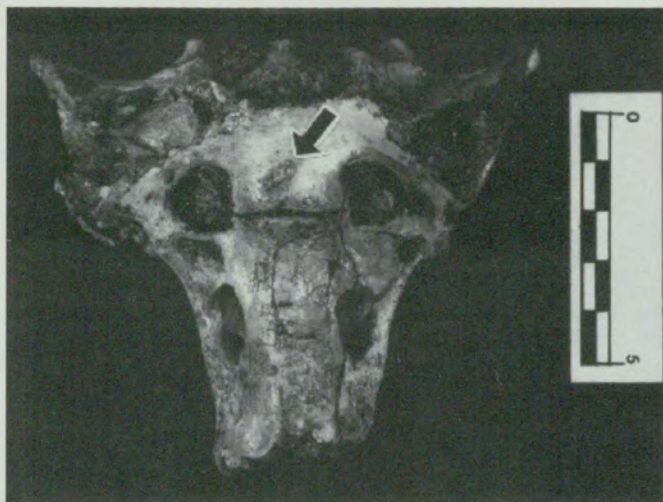
Figure 3. Anterior view of antelope skull with a puncture mark caused by the teeth of a carnivore.