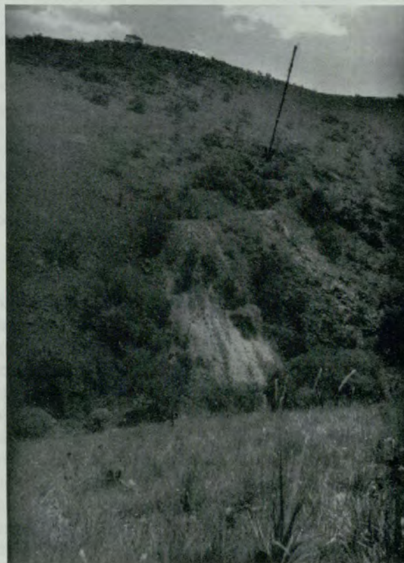
Figure 1. View of Haasgat from the opposite side of the valley of the Witwatersrand spruit. The arrow indicates the position of the large opening in the roof of the cave. Note the extensive dumps on the steep slope below the cave entrance

The cave originated as a phreatic chamber along a joint or small fault, in dolomite of the Eccles Formation of the Malmani Subgroup (Chunniespoort Group). The oldest sediment in the cave is a basal collapse breccia that must have formed shortly after the cave was drained of its phreatic water by the downcutting of the Witwatersrand Spruit Valley. This was followed by the deposition of a thick basal flowstone that cemented the basal collapse breccia. At this stage the cave was intersected by the formation of the valley, and developed an opening to the surface through which external clastic material and animals could enter the cave. From this stage onward the cave was filled with fossiliferous cave silt and breccia. These sediments were cemented by calcite deposited from percolating vadose water. Further cutting down of the valley led to the removal of the upper parts of the cave and the excavation of a smaller cave or Makondo (Brink and