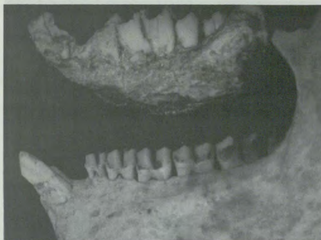
Figure 8. Teeth of Procavia transvaalensi Shaw (above) compared with a lower jaw of a large individual of Procavia capensis