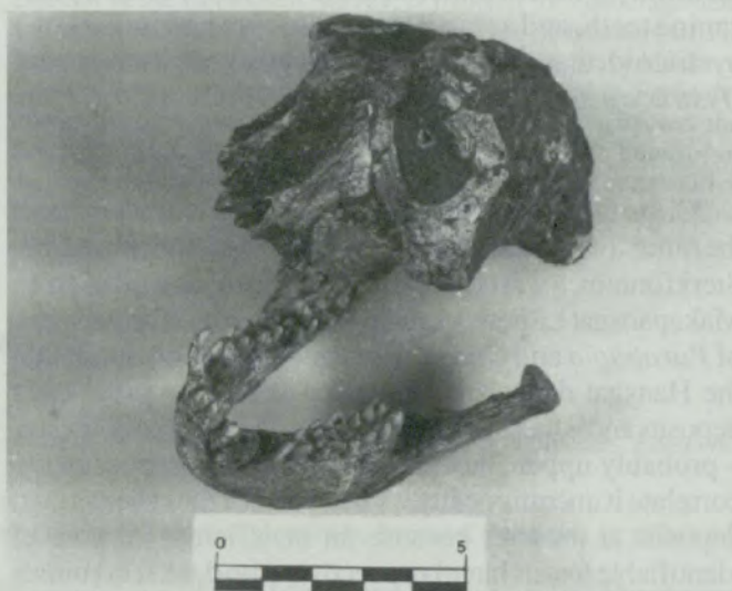
Figure 6. Partial skull of Cercopithecoides williamsi .

A left maxilla of a hyaenid, possibly Chasmaporthetes nitidula (Ewer) (Figure 7), was recovered from the dumps. The present specimen has a slightly larger pm^3 than most of the material from