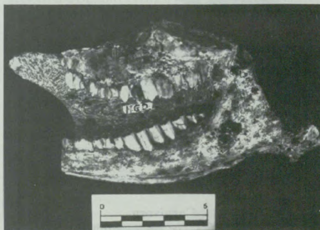
Figure 10. Maxilla and lower jaw of a specimen of Pelea capreolus Sundevall from Haasgat.