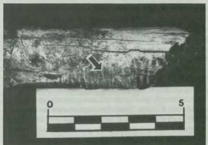
Figure 2. Bone gnawed by a porcupine

A nearly complete Parapapio (baboon) female skull, without the occiput and its canines (Figure 5), was found. It was a fairly young female with the second molars starting to erupt. A palate with some teeth of another juvenile individual was also recovered. According to Simons and Delson (1978), it would be unwise to attempt a definite identification on such an inadequate sample.