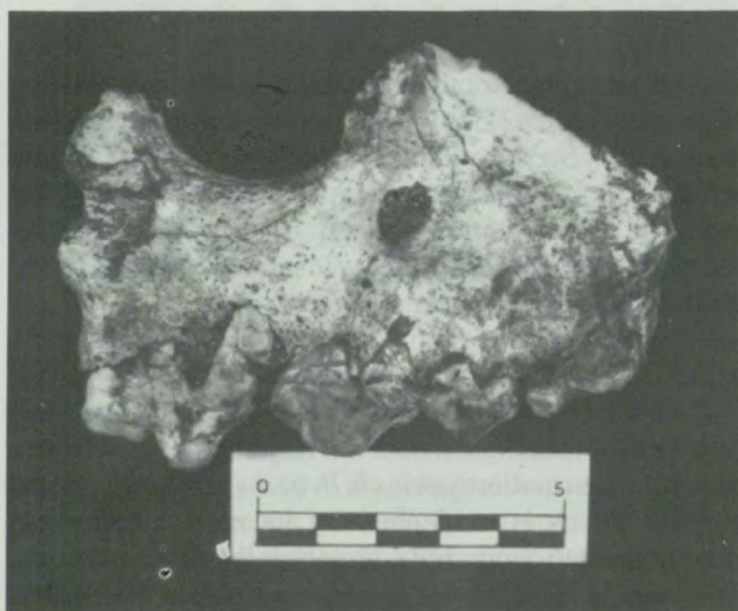
Figure 7. Lateral view of the left maxilla of a hyaena, possibly Chasmaporthetes nitidula (Ewer).

All the taxa recovered from Haasgat are known from all the other fossil-bearing caves in the Krugersdorp area, i.e. Sterkfontein, Swartkrans and Kromdraai, as well as from Makapansgat Limeworks near Potgietersrus. The presence of Parapapio and Chasmaporthetes leaves no doubt that the Haasgat deposit is of similar age to the other cave deposits and is therefore near the Plio-Pleistocene boundary – probably upper Pliocene. It is however, impossible to correlate it unequivocally with any one of the other known deposits at present, because an insufficient number of identifiable fossils have been recovered to date. If hominids