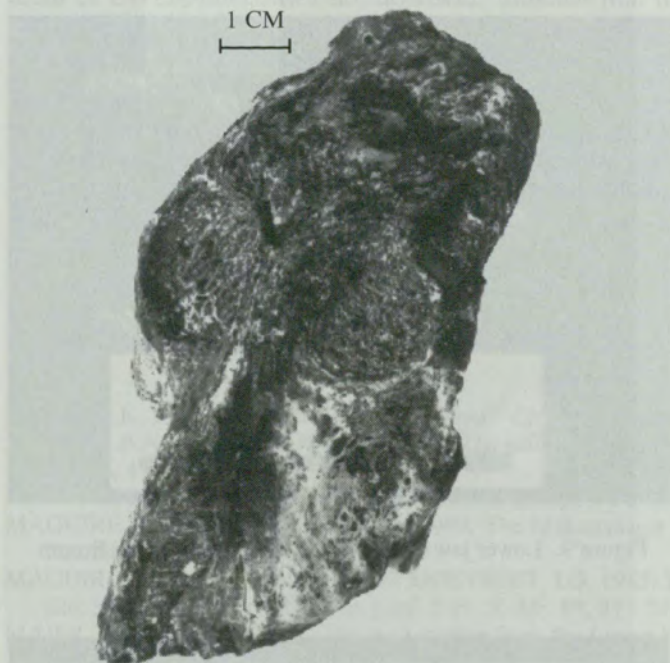
Figure 5. Skull of a young female Parapapio

The specimen does resemble a specimen of Parapapio broomi illustrated by Maier (1970).