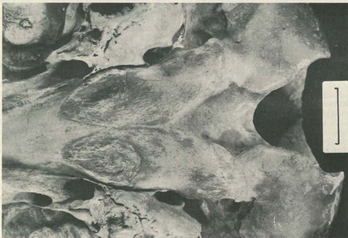
Fig. 1. Basioccipital of skull fragment M.2793 of Makapania broomi . The anterior side is to the left. The scale is in centimetres. Top.