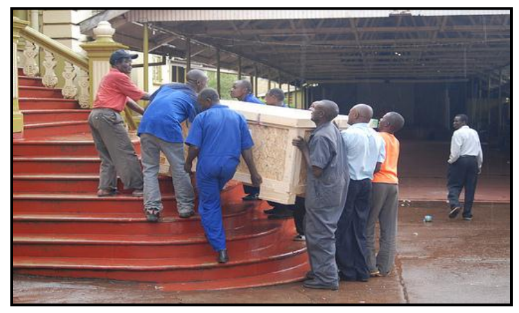
Delivering scanning equipment to the National Library of Uganda