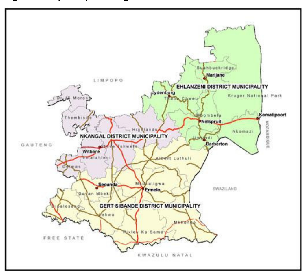
Figure 2. Map of Mpumalanga Province

Nkangala District: KwaMhlanga Government Offices and Nkangala FET College