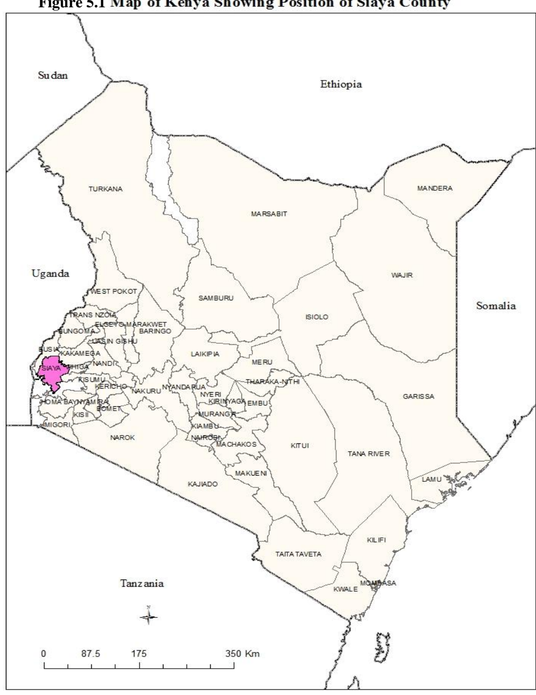
Figure 5.1 Map of Kenya Showing Position of Siaya County