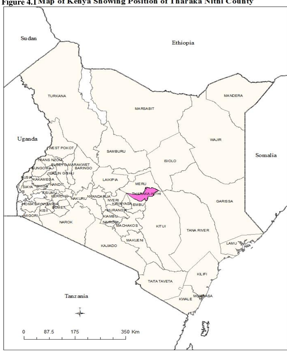
Figure 4.1 Map of Kenya Showing Position of Tharaka Nithi County