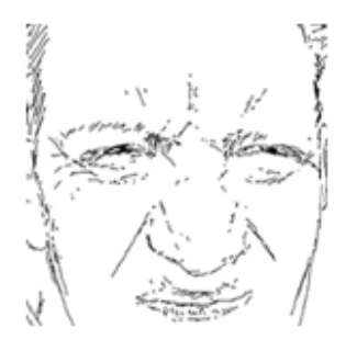
Figure 9: Marc Edwards, 20050413 , 2006. Pigment print on archival paper, 60 x 60 cm. Collection, the artist.