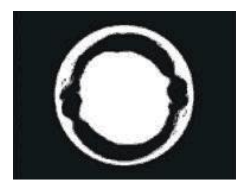
Figure 4: Marc Edwards, Anything of small value , 2000. Animated gif. and html. 640 x 480 pixels.