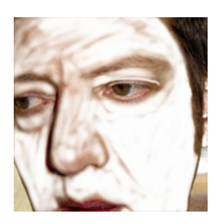
Figure 20: Marc Edwards, 20050505, 2008. Pigment print on archival paper, 60 x 60 cm. Collection, the artist.

20050505 (Fig. 20) has a tenuous, almost submissive and vulnerable quality, and the powdery 'makeup' or paint accentuates an expression of resignation.