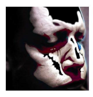
Figure 15: Marc Edwards, 20070507, 2007. Pigment print on archival paper, 60 x 60 cm. Collection, the artist.

The saturated colour in 20050507 (Fig. 15) adds to the intensity of the mask, which consists of some digital artifact, which contributes to the vulnerability and the uncertainty of the expression. This image was constructed in Photoshop using untried filter combinations, working with a digital medium to produce unpredictability, incorporating mistakes into the process. What results is an image or a self-portrait image, with a complexity of layers, which construct an ambiguous identity that is almost magical.