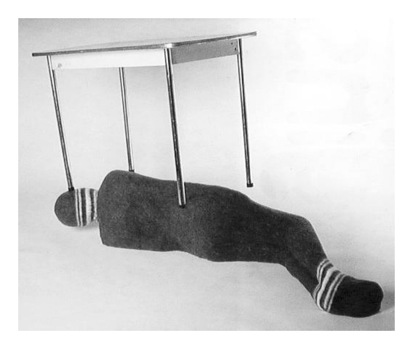
Fig. 3: Marc Edwards, Neither Known nor Unknown , 1995. Fiberglass, blanket and table. 180 cm x 80 cm x 110 cm. Collection: Johannesburg Art Gallery.

concepts, as Neustetter suggests, incorporate digital interactivity. It is these concepts and the search for what Krauss (1999) suggests a "counterintuitive invention", which have informed this study and contributed to the development of the installed exhibition of digital self-portraits that are investigated in this research project.