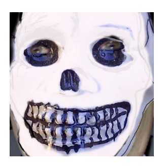
Figure 21: Marc Edwards, 20050506 , 2008. Pigment print on archival paper, 60 x 60 cm. Collection, the artist.

20060826 (Fig. 22) intended to express an ethereal self, an enigmatic identity, so as to add to a variety of expressions and identities. The subtleties of the image on the white backing paper make for a vulnerable image and a tenuous portrait.