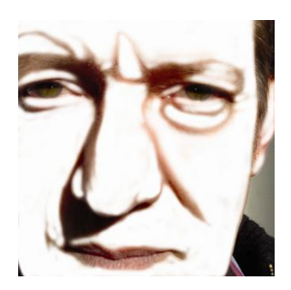
Figure 11: Marc Edwards, 20070506, 2007. Pigment print on archival paper, 60 x 60 cm. Collection, the artist.