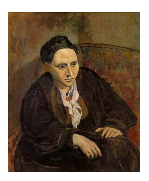
Fig 2: Pablo Picasso, Portrait of Gertrude Stein , 1906 (Soussloff 2004: 7). Oil on canvas, 100 x 81.3 cm. Metropolitan Museum of Art, New York.

According to Soussloff (2006:7), we recognize the interiority of Gertrude Stein in this painted portrait, despite the layered complexity of in the portrait.