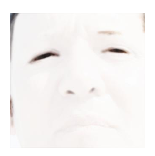
Figure 22: Marc Edwards, 20060826, 2008. Pigment print on archival paper, 60 x 60 cm. Collection, the artist.

20060826 (Fig. 22) intended to express an ethereal self, an enigmatic identity, so as to add to a variety of expressions and identities. The subtleties of the image on the white backing paper make for a vulnerable image and a tenuous portrait.