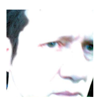
Figure 10: Marc Edwards, 20050431, 2006. Pigment print on archival paper, 60 x 60 cm. Collection, the artist.

20050431 (Fig. 10) and 20050506 (Fig. 11) were chosen for their questioning expressions, which seem to offer a vulnerability, expressed in the eyes, which offer another layer to the image and in the lips where a pursed expression adds to a determination in the way the self-portrait is expressed.