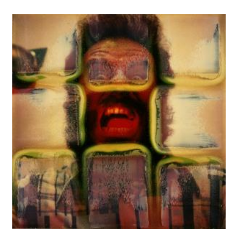
Figure 5: Lucas Samaras, Photo-Transformation , 1973 (http://www.getty.edu/art/gettyguide/artObjectDetails?artobj=131374). Polaroid SX 70 print. Getty Museum, Los Angeles.

A standard square format of 60 x 60cm is used for all images in this series so that they refer to the square format of instant Polaroid images, drawing attention to the remediation of an instant photographic medium. This is similar to the manipulated Polaroid self-portrait image Lukas Samaras produced in 1973, where he mediated the close up image he recorded of himself by rubbing the pigment (wet dye) of the instant photograph, before it set, creating a painterly image quality. Samaras produces a post-photograph by obscuring the authenticity of his identity and attempting to introduce an interiority by manipulating the pigment to create an enigmatic portrait, Photo-Transformation (Fig. 5). This physical malleability is a precursor to the digital malleability referred to earlier.