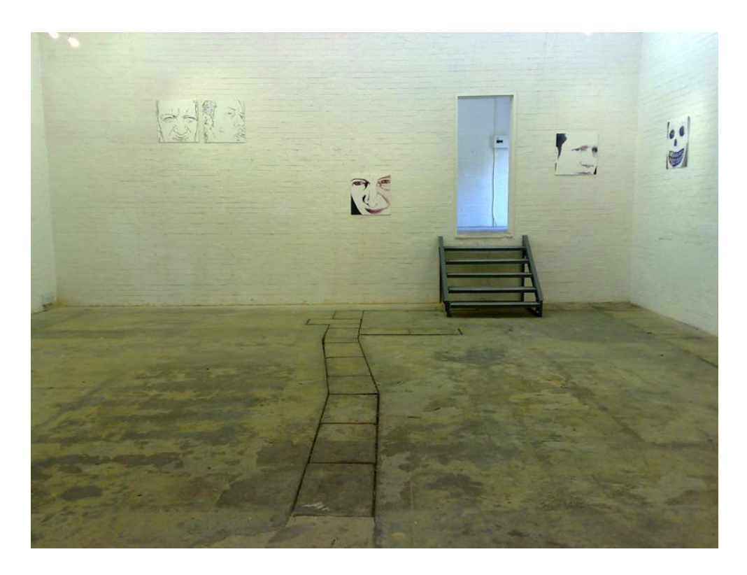
Fig. 30: Marc Edwards, Post-medium self-portraits at the substation, 2009. Installation view 2, South, from the Substation Gallery, University of the Witwatersrand.