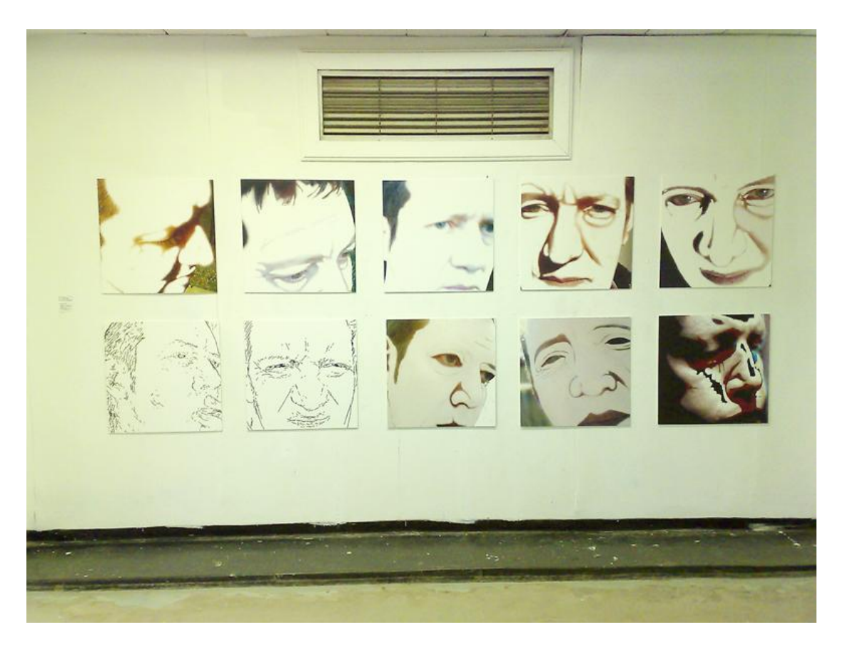
Figure 26: Marc Edwards, Post-medium self-portrait , 2007. Installation view, from University Corner, University of the Witwatersrand, Johannesburg.

with numerous images and identities. The specific site in this case has affected the ways in which the images are read, and meaning is constructed in digital self-portrait images.