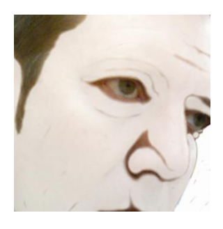
Figure 12: Marc Edwards, 20050313 , 2006. Pigment print on archival paper, 60 x 60 cm. Collection, the artist.

20050313 (Fig. 12) was recorded using a Sony Ericsson P190 I camera phone with a 3.2 megapixel camera, resulting in low resolution. The relatively strong available light gives sufficient detail to the eyes that are accentuated by the white layer. The ambiguity in this self-portrait image lies in the overexposed image parts that are at once, mask and painted makeup. These ambiguities rely on a range of references used in the remediation applied.