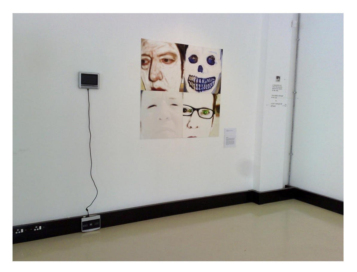
Fig. 28: Marc Edwards, Post-medium self-portrait 3 , 2009. Installation view, from the FADA Gallery, University of Johannesburg.

Art, Design and Architecture Gallery (Fig.28). (This curated group exhibition looked at Practice led Research in the faculty, and attempted to find patterns of intentions.) Each time the self-portrait images were exhibited they would be re ordered according to the space (site) in a post medium condition. The allocated space here is important, as it allows the layers and ambiguity in the work to develop further. The potential content in the work is developed, firstly by the limited number of images shown, the selection of the images shown, and the inclusion of a video sequence of images, with the addition of audio, sets the work up with multiple layering and multiple mediums, constructing a new subject and as a result, a new layered and ambiguous identity in a post-medium condition.