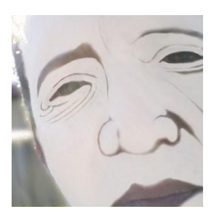
Figure 13: Marc Edwards, 20050502, 2006. Pigment print on archival paper, 60 x 60 cm. Collection, the artist.

20050512 (Fig. 14) is a self-portrait image with enough detail to create an accurate likeness where a vulnerability is developed with a combination of devices, which include the detailed bloodshot eyes, the pursed lips and the tenuous quality of the painted mask, where decorative shapes in the outline of the mask add a poetic quality.