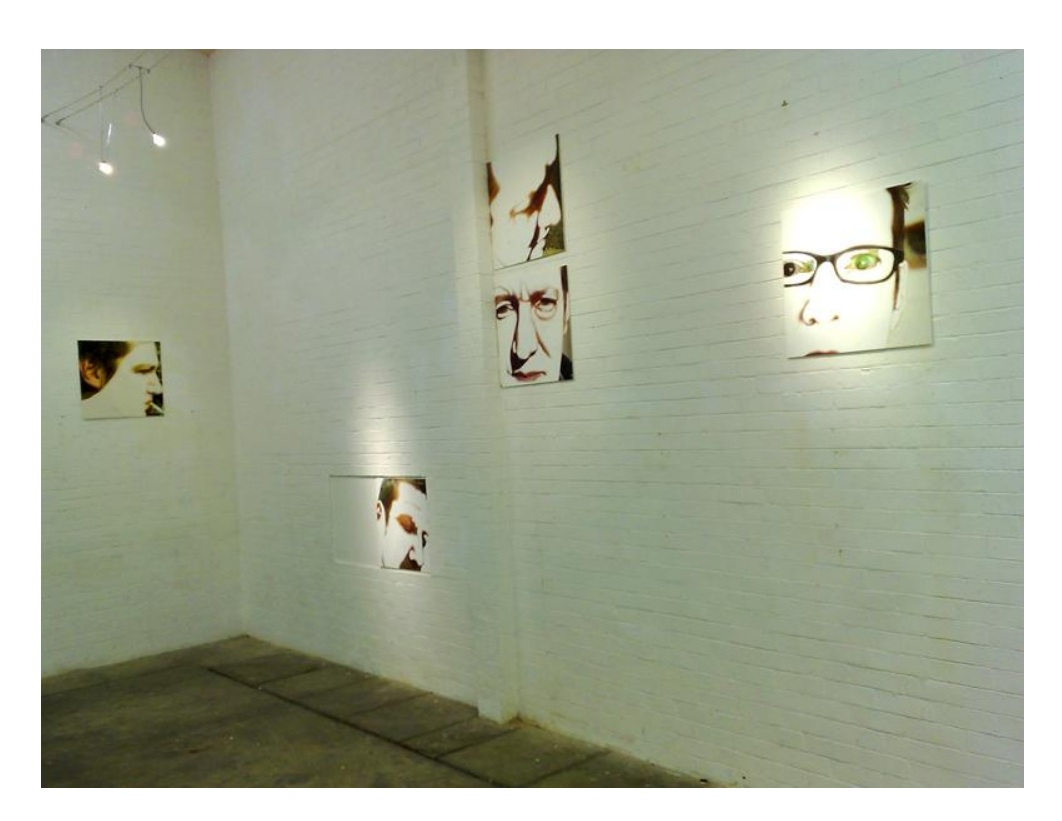
Fig. 31: Marc Edwards, Post-medium self-portraits at the substation , 2009. Installation view 3, North East, from the Substation Gallery, University of the Witwatersrand