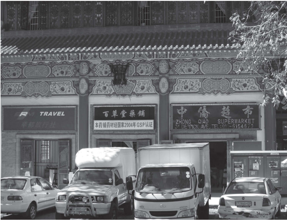
FIGURE 29.3: Despite troubled beginnings, Chinatown in Cyrildene is a well-established immigrant space, and is likely to remain a visible marker of the Chinese presence in Johannesburg for many years to come.

increase in the number of Chinese immigrants arriving from the late 1990s. The Chinese arriving in Cyrildene replaced a mainly Jewish population which was emigrating from South Africa, and were able to purchase suburban properties at affordable prices.