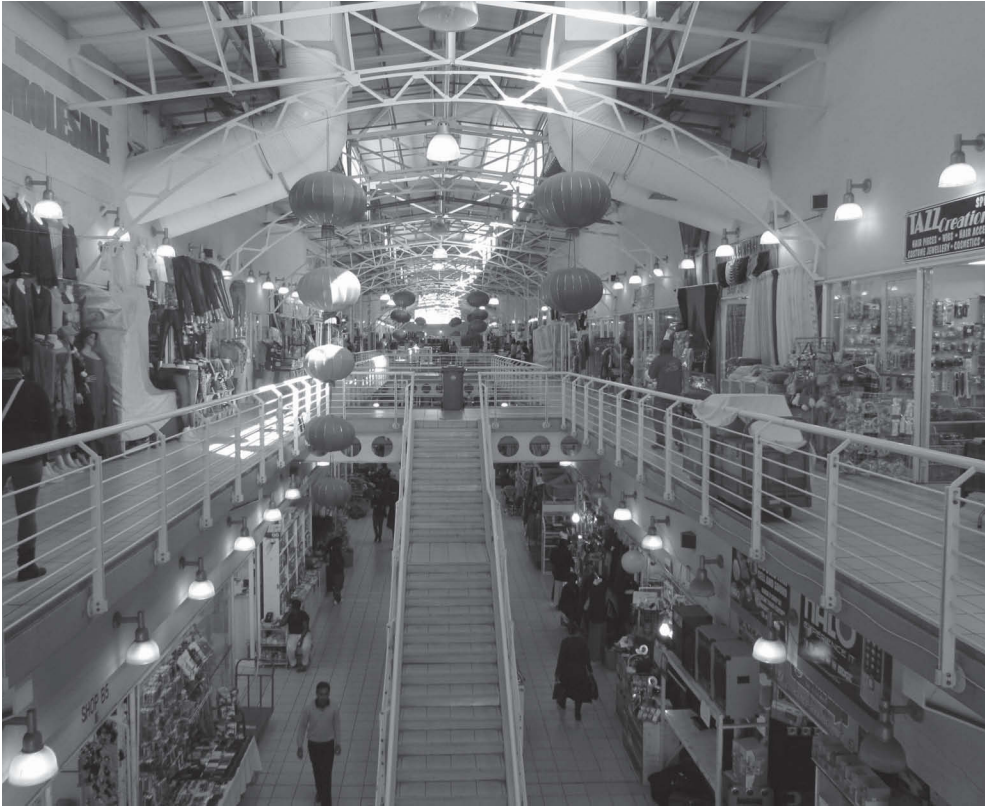
FIGURE 29.4: China Mall on Main Reef Road, like many similar shopping centres dotted around Johannesburg, helps to mark Chinese space on the mining belt.

shops in small towns across southern Africa. As this happens, Johannesburg is changing its function from being the primary site of Chinese malls in southern Africa to being the hub of a distributed network of Chinese enterprise across the subcontinent. Significant shifts are occurring within Johannesburg as well. The opening of the China Discount Shopping Centre in Randburg in 2013 signals a move away from the mining belt and into the historically white and more affluent suburbs, with Chinese entrepreneurs now deliberately targeting the (mainly white) middle-class market.