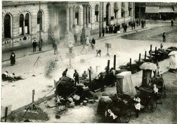
Photo of Asphalt Road being laid by Jenkins & Co., outside G.P.O., Johannesburg