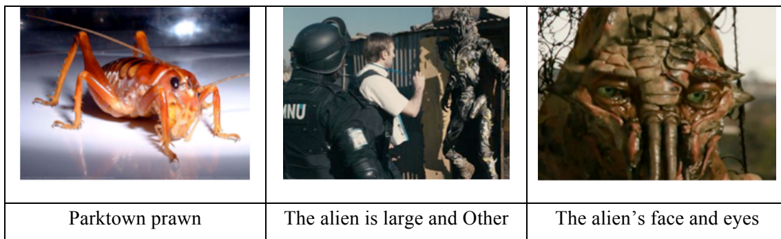
Figure 1. Images of prawns

The aliens are depicted as large and insect-like. They resemble the "Parktown prawn" ( Libanasidus vittatus , a monotypic king cricket), which although harmless instils fear in many South Africans. Frightening as the Aliens' size and appearance are, they nevertheless have human features that enable audiences to empathise with them. Their eyes are expressive, their facial movements reveal tenderness, and they act with an intelligence that surpasses our own.