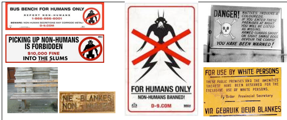
Figure 2. Signage in District 9

The signage in District 9 mirrors old apartheid signs (see Figure 2). Notice how “humans” and “whites” are the linguistically unmarked form, with the prefix “non” in “non-humans” and “non-whites” indicating deviation from the norm. These outward signs that denote unequal rights of access, point to the underlying practices of entitlement and exclusion that produced inequality based on difference.