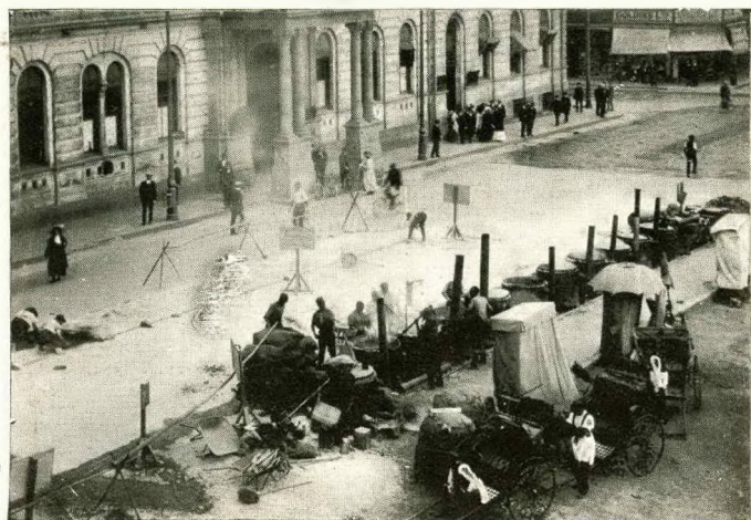
Photo of Asphalt Road being laid by Jenkins & Co., outside G.P.O., Johannesburg