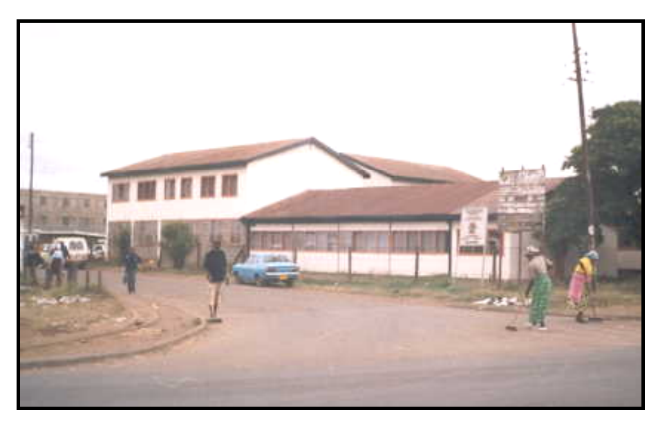
Photo 3.1. Housing and Community Development Department Offices, Dandora Phase 1

There are several factors why HDD has failed in controlling development in the settlements under its mandate. Lack of funding, lack of staff, corruption, unofficial withdrawal from its mandate of development control, lack of knowledge of council's regulations, unrealistic requirements by the NCC and operations of powerful individuals within and outside of the state were mentioned as some of these factors. The previous officers of HDD were said to have been corrupt. HDD's relatively large initial workforce, of 589 persons, also developed many informal linkages, which further undermined the department's efficacy in development control. Further, local people were largely unaware of the council's requirements for development relating to plot sizes, plot ratios, etc. There are people in Dandora, involved in informal sale of plots as small as 50m<sup>2</sup>, with no access to infrastructure and services (see photo 3.3). Unrealistic expectations by the HDD also undermined development control. In Dandora, Umoja, Kayole and Mathare North, only one storey development 'is allowed'. Developments of up to six storeys are very common (see photo 3.2). The prototype plans developed by HDD for the area still reflect the single storey requirements. Powerful individuals continue to build without consulting HDD. They use their individual ties within the government for protection. On the other hand the poor develop informally, backed by local chiefs and politicians.