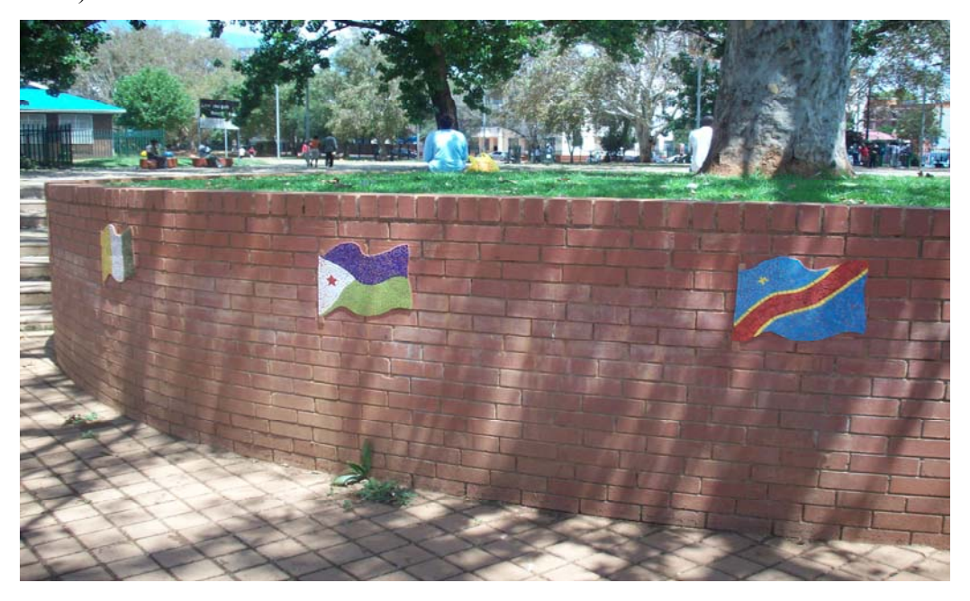
Fig. 6b: some African countries' flags at the Yeoville Park's wall

In this figure at the both extremes are Ivorian and Congolese (DR) flags