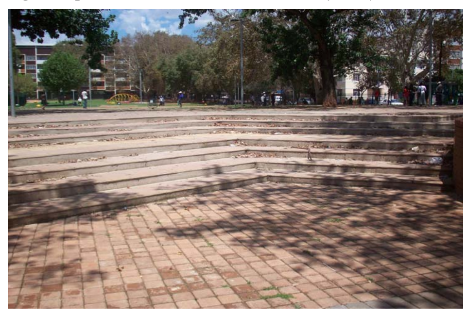
Fig. 5: The Rockey Street Market: view from RRHS