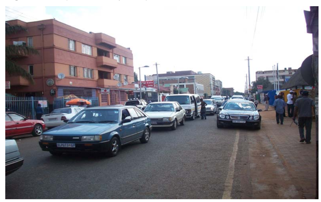
Fig 2. RRHS

The executive marketing and communication of JDA, commenting on behalf of his institution says: