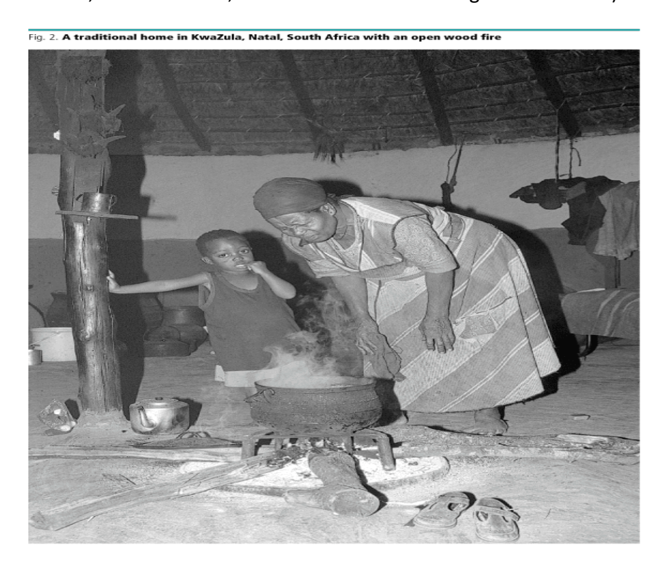
Figure 2 A traditional home in KZN, South Africa with an open wood fire.

research. Pollution from coal is a huge problem particularly for women and children's health outcomes, causing health problems such as lung cancer and child mortality (Bruce, N., Perez-Padilla, R., & Albalak, R. 2000. Ezzati, M. 2005. World Health Organization 2009).