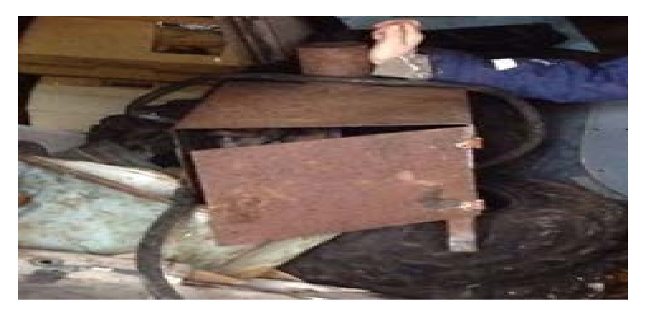
Figure 7: Shangaan stove inside a respondent's household in Ramaphosa. 10/11/2015

Respondents who stay in one room shacks store their coal just behind the entry door whilst the established families store their coal in a separate room. Coal fire is prepared twice a day, i.e., in the mornings and evenings. Five of the eleven interviewed respondents were observed using their stoves. All five stoves were not efficiently channeling the smoke through the chimney. Evidence of this was a smoky room and soot on the surfaces of these homes. The other three homes belong to established families who avoid this situation by having big windows that create sufficient ventilation inside.