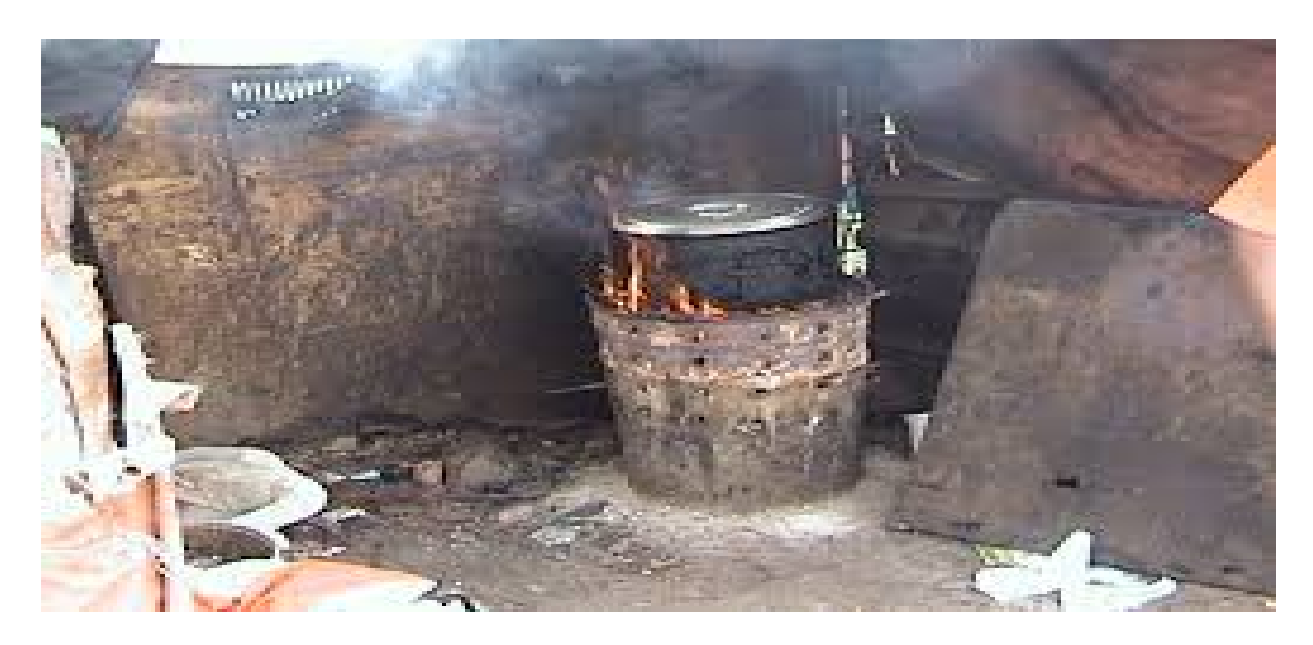
Figure 8: Imbawula (brazier) in a separate room for cooking in one respondent's household in Ramaphosa. Picture taken by author, 10/ 10/ 2015