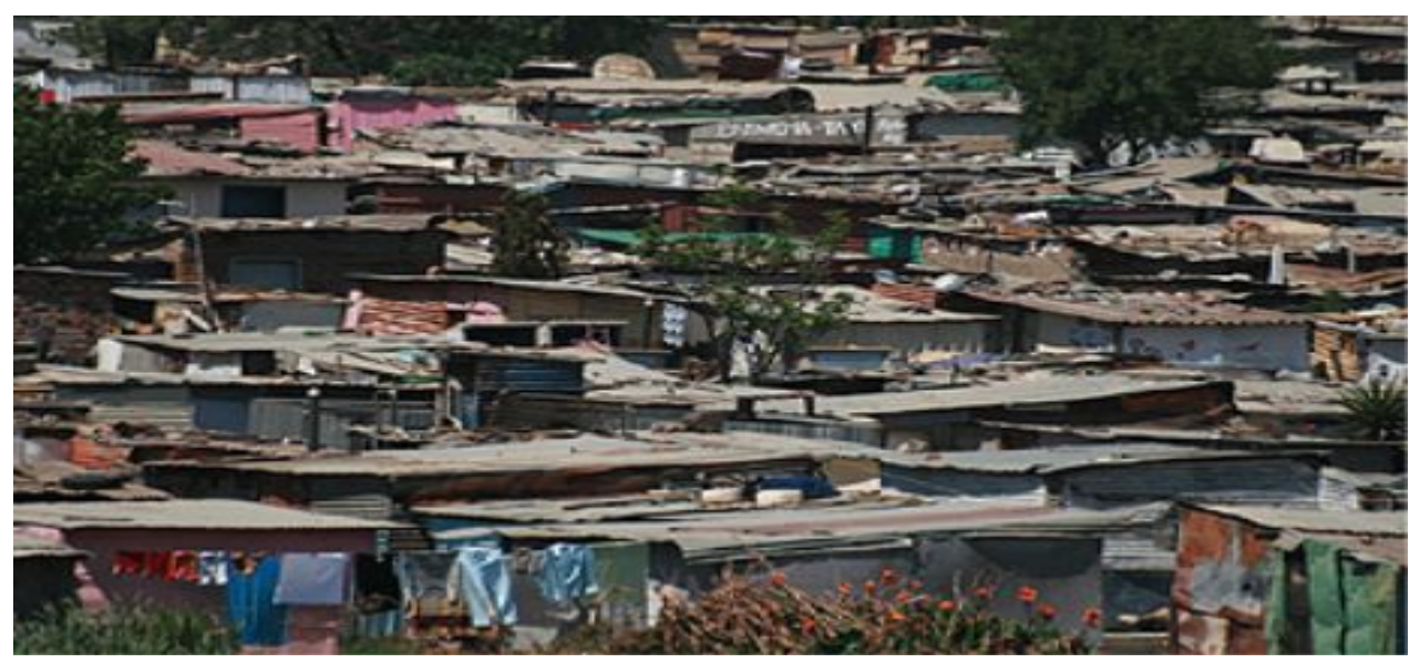
Image taken from the Internet. The link is provided in Page 45 of the Reference list.

Ramaphosa is a very densely populated area containing various ethnic groups and Nationalities. Its residents came from long established neighbouring communities like Reiger Park, Vosloorus, Daveyton and others. Other residents come from the Limpopo, Eastern Cape and Kwa-Zulu Natal Provinces. Residents have chosen this area because it is closer to both Germiston and Boksburg industrial towns which they can access in search of job opportunities. There is also a prominent presence of foreign nationals from countries like Malawi, Mozambique and Zimbabwe.