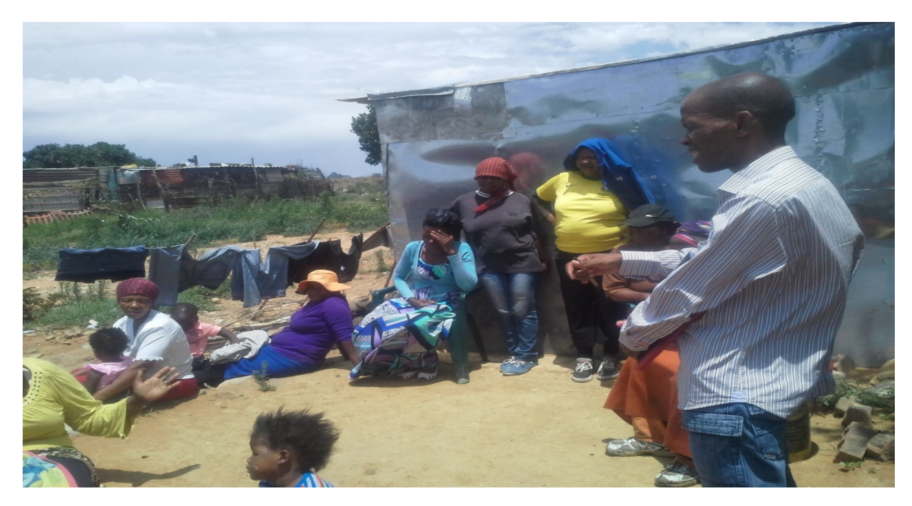
Figure 5: Focus Group Discussion in Ramaphosa Informal Settlement (Picture taken by author: 08/11/2015)

The limitation of these expert interviews is in my failed attempts to interview the ward councilor. This could not take place as he kept on requesting a postponement of our meeting up until writing of this report.