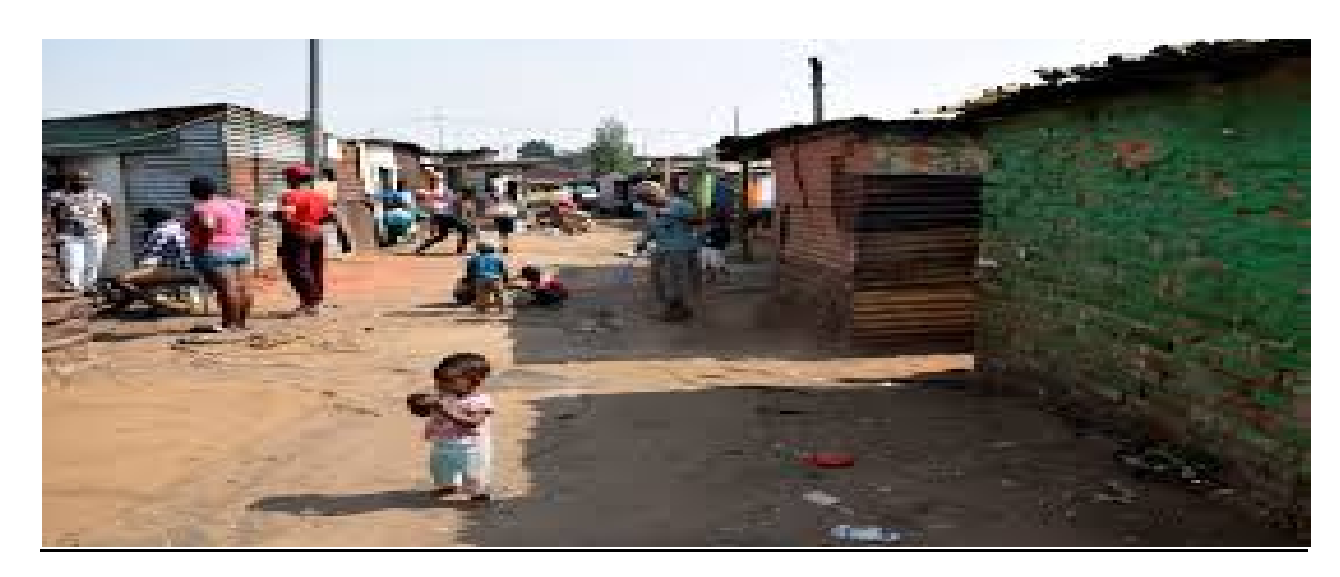
Figure 3 Young people in the streets of Ramaphosa Informal Settlement. on the 10 October 2015

Ramaphosa is a very densely populated area containing various ethnic groups and Nationalities. Its residents came from long established neighbouring communities like Reiger Park, Vosloorus, Daveyton and others. Other residents come from the Limpopo, Eastern Cape and Kwa-Zulu Natal Provinces. Residents have chosen this area because it is closer to both Germiston and Boksburg industrial towns which they can access in search of job opportunities. There is also a prominent presence of foreign nationals from countries like Malawi, Mozambique and Zimbabwe.