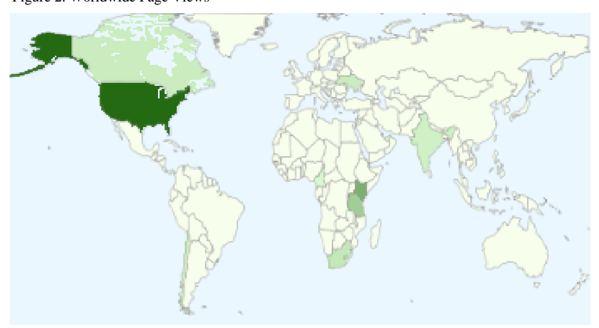
Figure 2. Worldwide Page Views