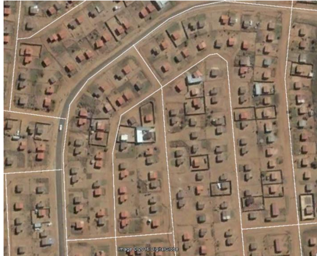
Bram Fischerville 2004