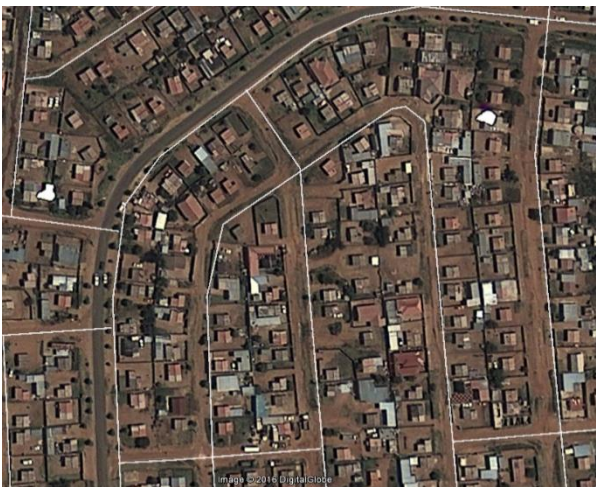
Bram Fischerville 2014