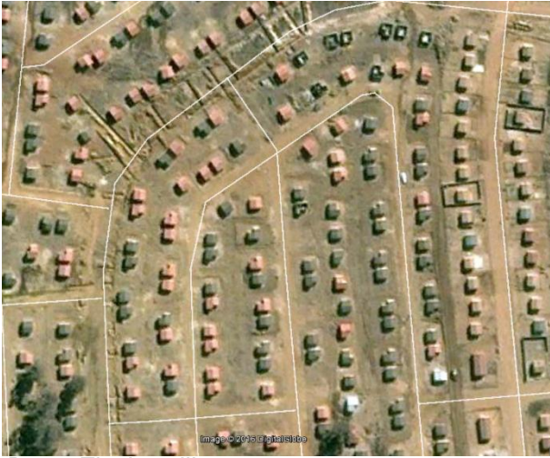
Bram Fischerville 2001