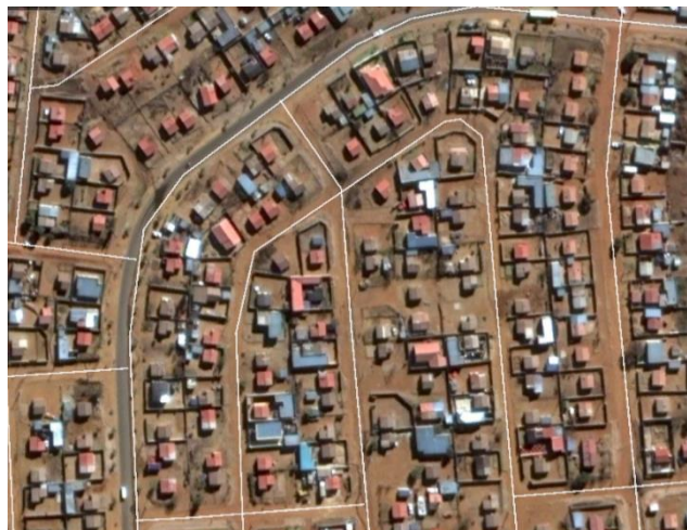
Bram Fischerville 2011