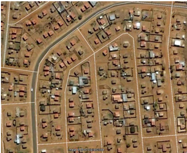
Bram Fischerville 2007