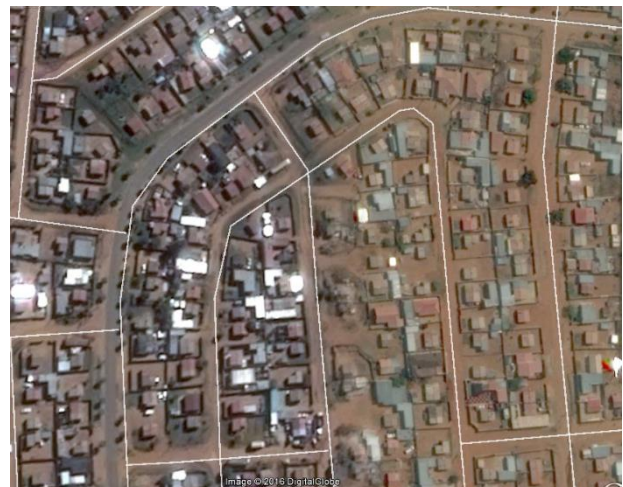
Bram Fischerville 2016